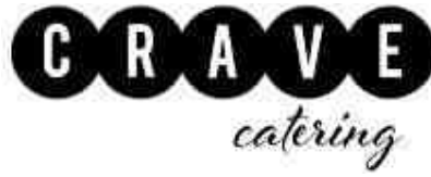
CRAVE Catering Cravecateringevents.com