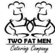
Two Fat Men Catering TwoFatMenCatering.com