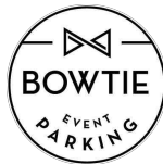
Valet & Parking Management