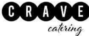
CRAVE Catering cravecateringevents.com