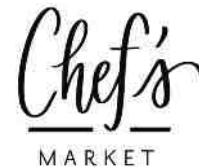
Chef's Market ChefsMarket.com