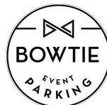
Valet & Parking Management