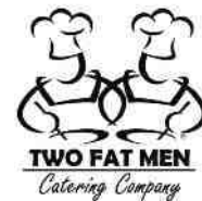
Two Fat Men Catering TwoFatMenCatering.com