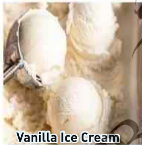
Vanilla Ice Cream