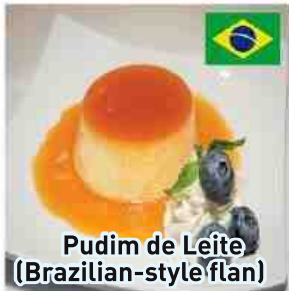
Pudim de Leite (Brazilian-style flan)

Desserts are available at an additional cost with the "Value" Package. Check with your Host or request a separate tab! Indulge in favorites like Homemade Pudim de Leite (Brazilian-style flan), Crème Brûlée, and Papaya Cream—or explore our other delightful options!