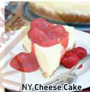
NY Cheese Cake