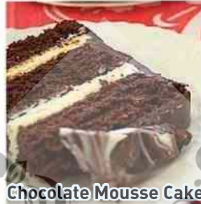
Chocolate Mousse Cake