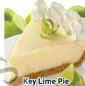
Key Lime Pie