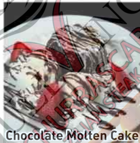
Chocolate Molten Cake