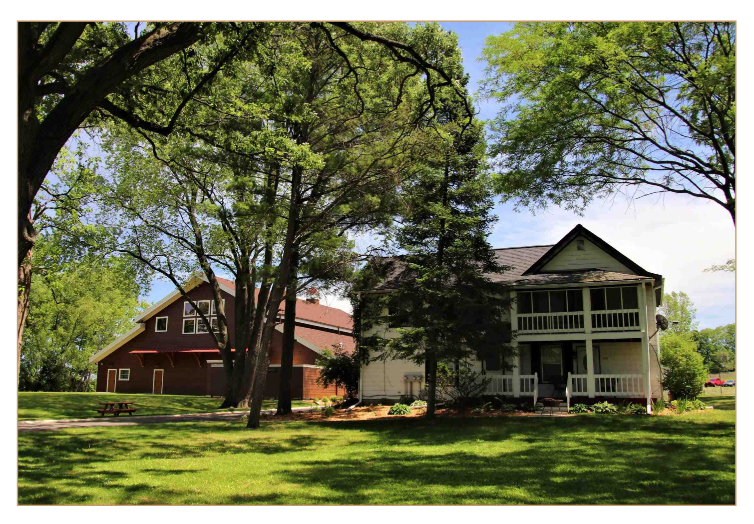
Prices subject to change without notice October 3, 2024

If you are renting the farmhouse and you still need additional space for your event, we have two electrical hookups for RV's on the south side of the parking lot. (These are only available if you are renting the farmhouse and need additional space). Cost: $40 per electrical hookup.