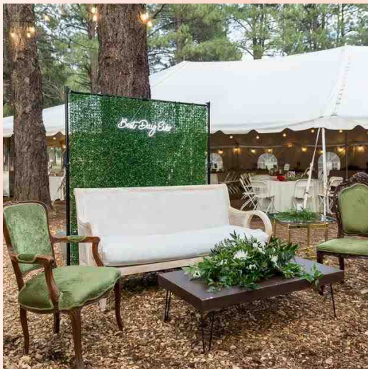
Birdsong Wedding Photography