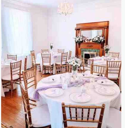
View Full Photo Gallery.