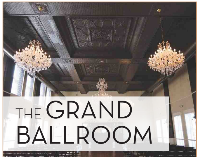
THE GRAND BALLROOM

The Grand Hall rental can accommodate approximately 60 guests.