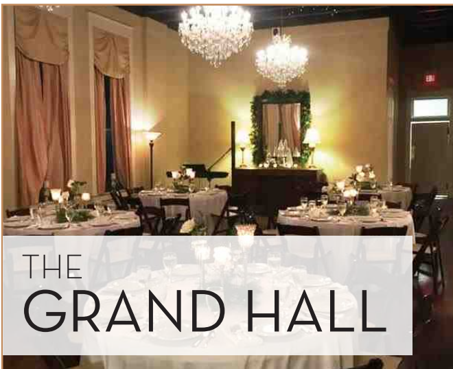
THE GRAND HALL