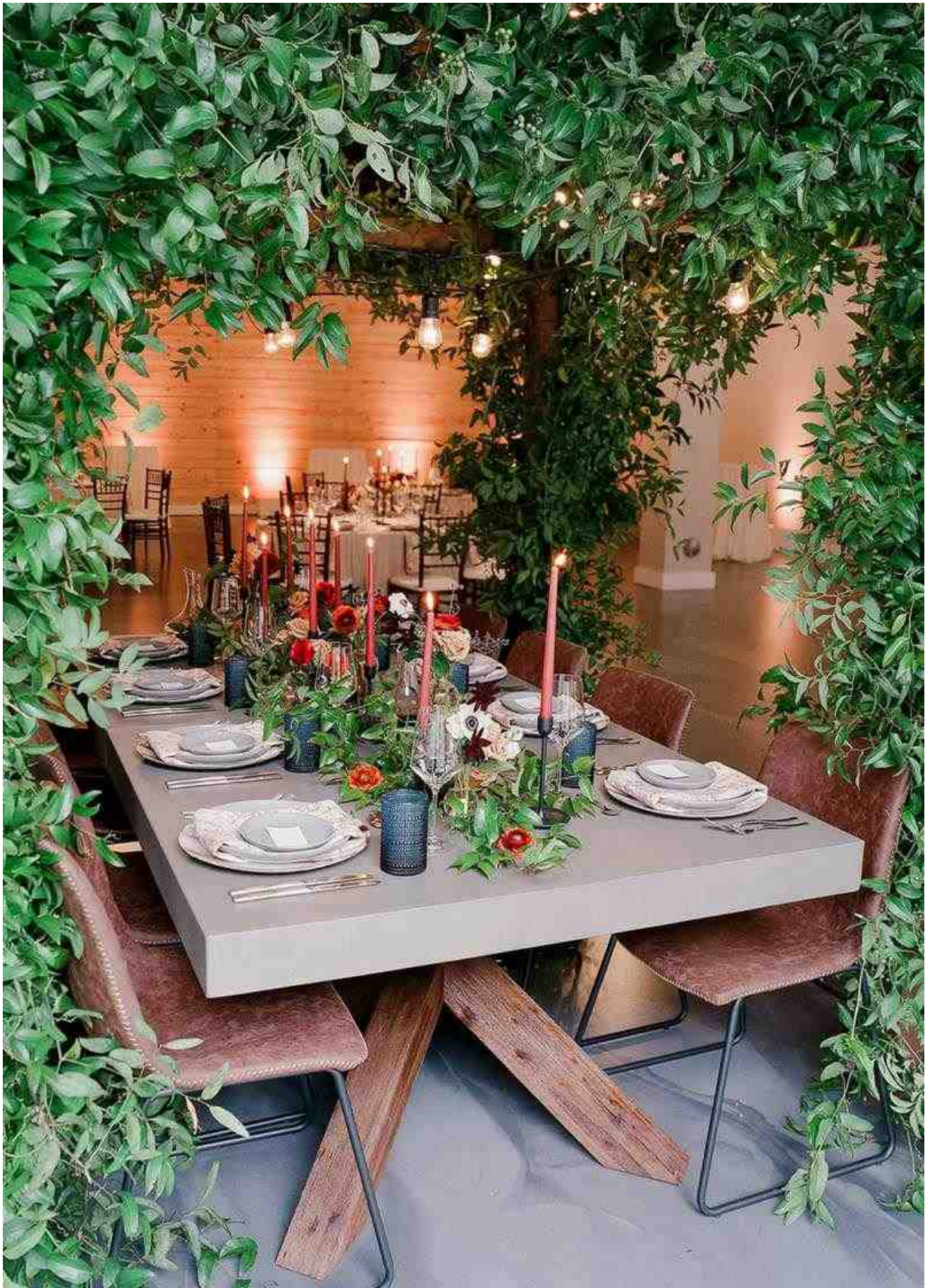
BARTIZAN WEDDINGS 24