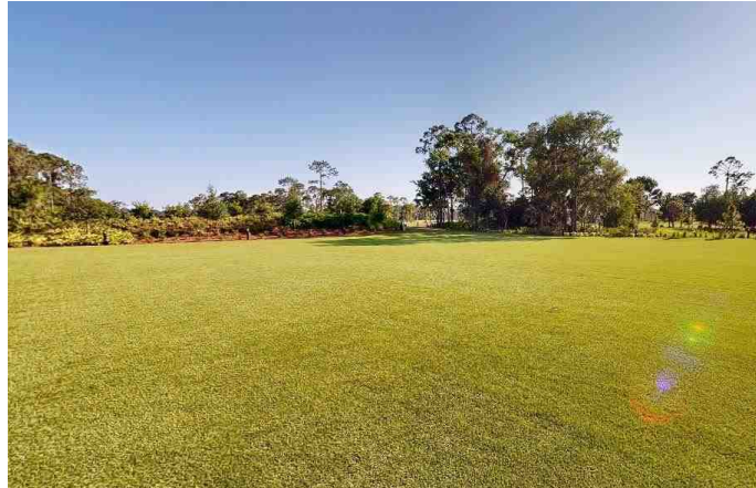
The 19 th Green