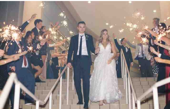
South Floridian Terrace