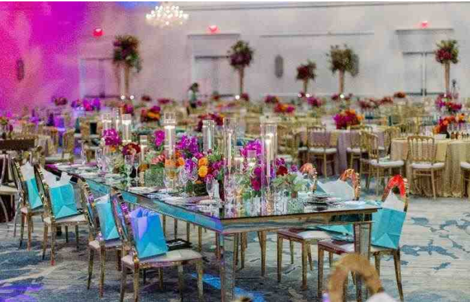
Bonnet Creek Ballroom

Elegance and sophisticated style await, with magnificent chandeliers to the lasting impression of rich appointments with each of our indoor ballrooms and gathering spaces, to create the perfect backdrop to your dream wedding.