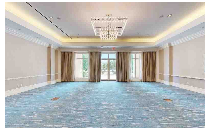
Intimate Gathering Rooms