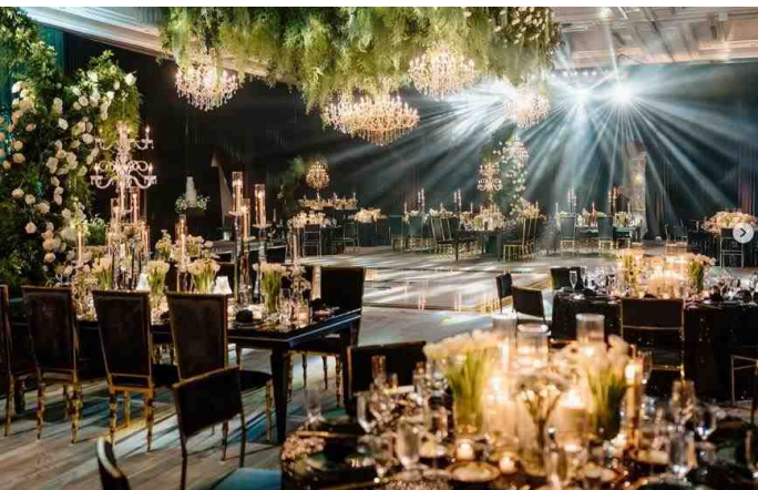
Central Park Ballroom