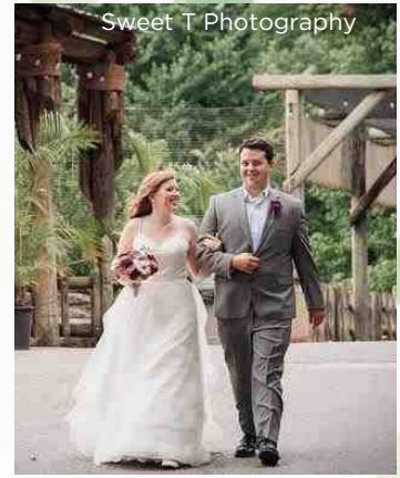
Sweet T Photography