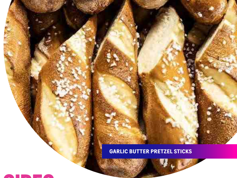
GARLIC BUTTER PRETZEL STICKS