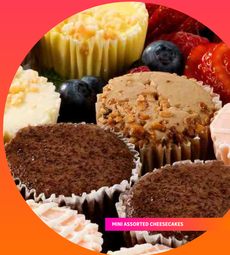
MINI ASSORTED CHEESECAKES

*ITEM IS NOT INCLUDED IN CRAFT YOUR OWN ("CYO") SELECTIONS.