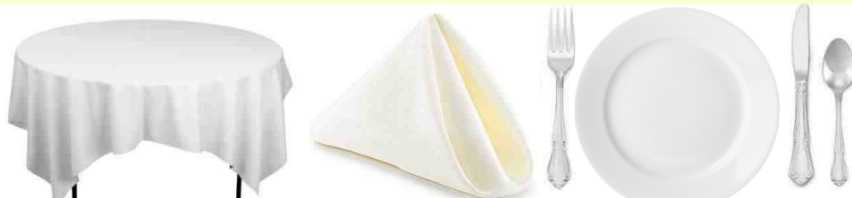
white or ivory square table linens, white or ivory napkins, china, silverware