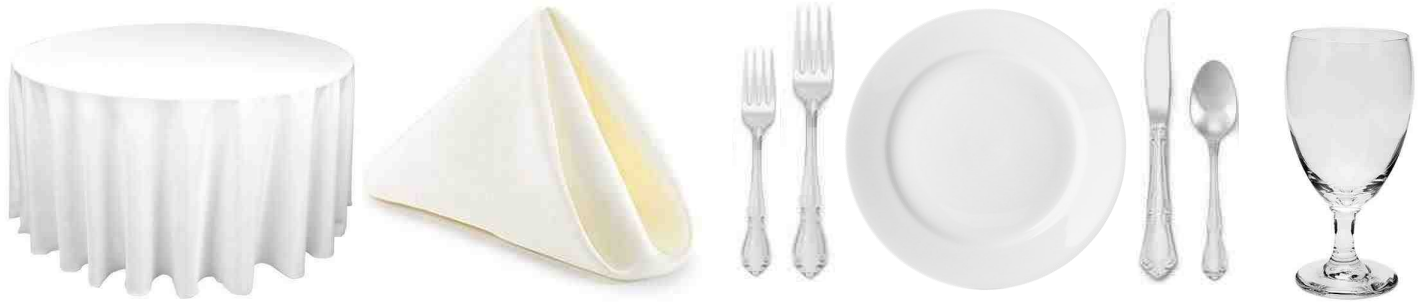
white or ivory floor-length table linens, white or ivory napkins, china, silverware, water glasses