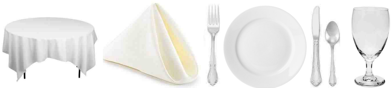
white or ivory square table linens, white or ivory napkins, china, silverware, water glasses

The above equipment is included in your package.