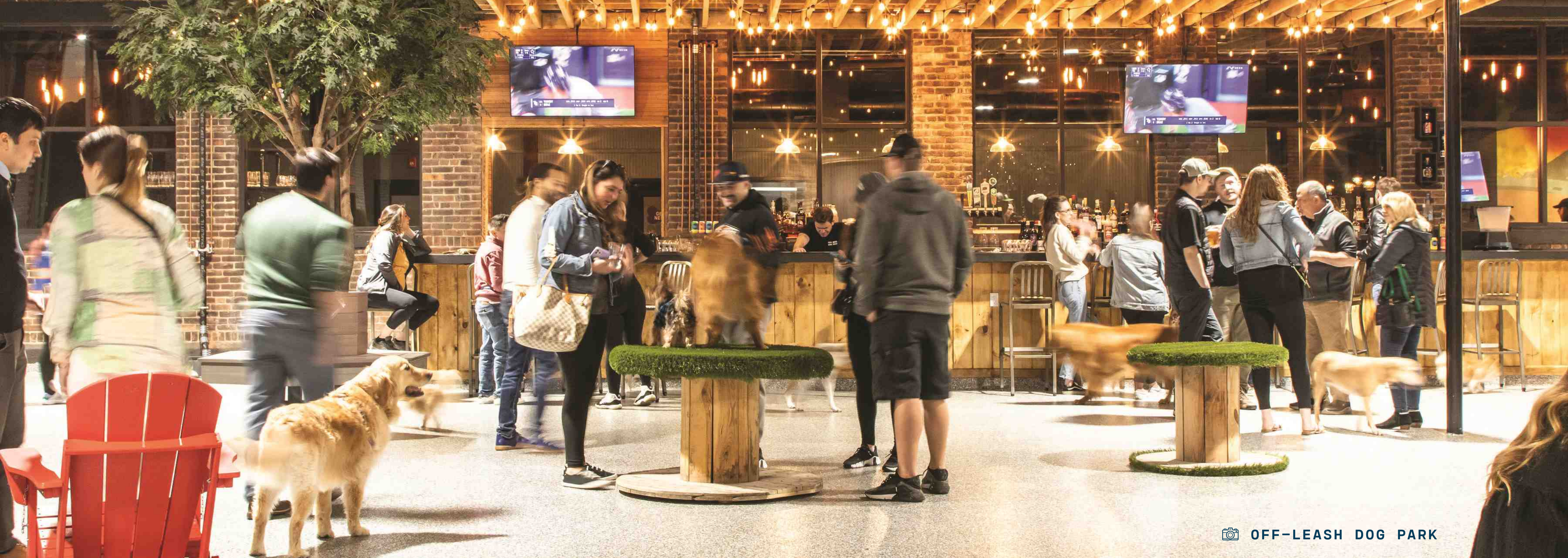
📷 OFF-LEASH DOG PARK