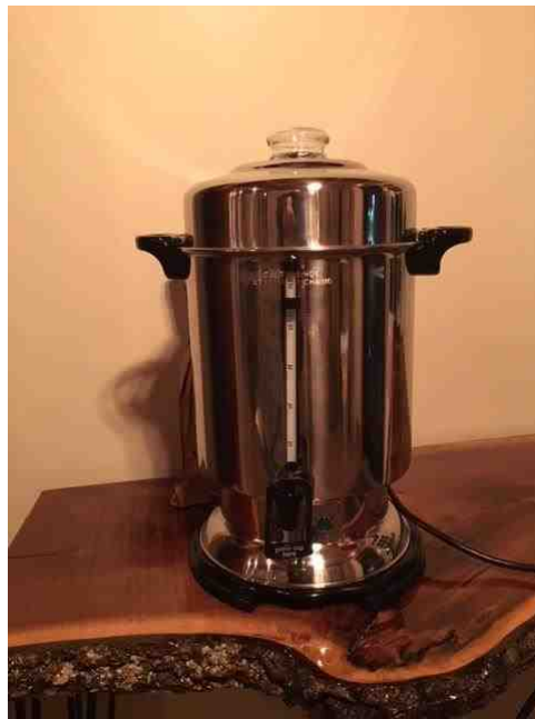
60 Cup Coffee Maker