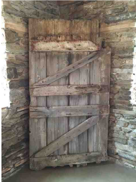
Rustic Back drop for photo booth