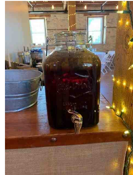
5 water, tea, and lemonade glass dispensers