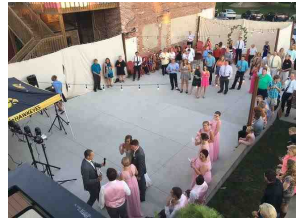
Music Lights and Dancing under the stars