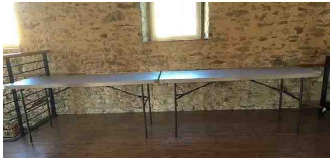
6'-Buffet Tables (5)