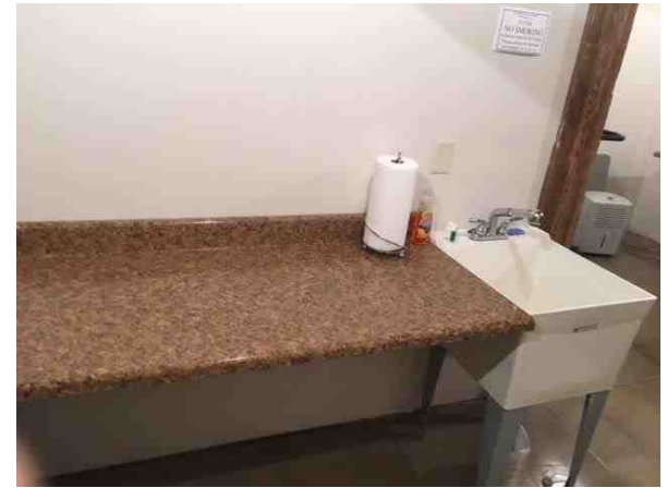
Prep Kitchen-Oven range-freezer-refrigerator-counter space and tub sink.