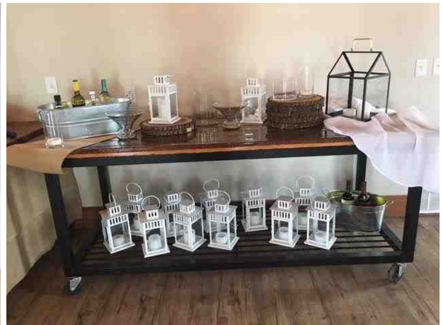
Various accessories you can use