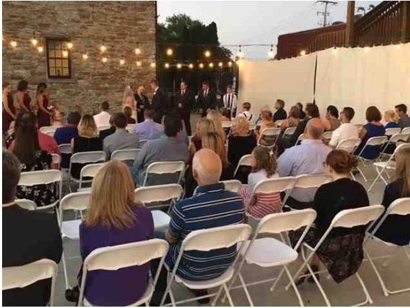
Outside Terrace Ceremony with String Lights