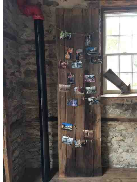
Entry barn door picture pinup