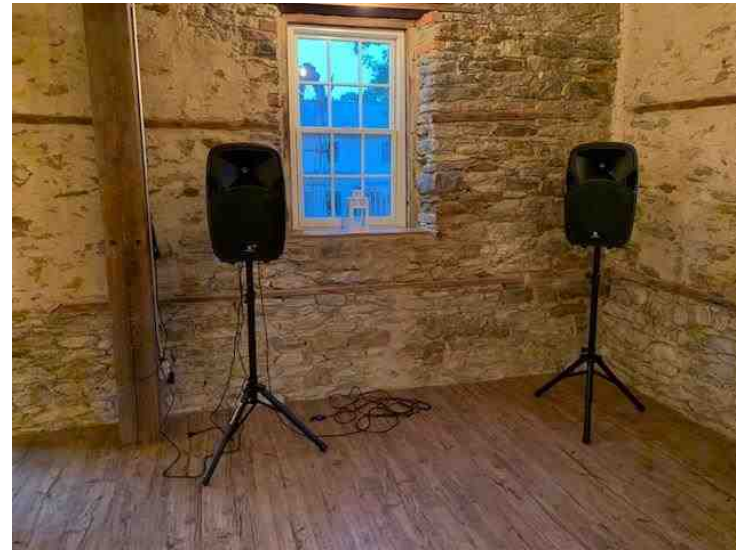
PRORECK PARTY 12 Portable Professional PA Speaker System (New July 2019) Bluetooth/USB/SD Card Reader FM Radio/Remote Control/Speaker Stand

For use indoor ceremony and speeches, or outdoor on the terrace during ceremony.