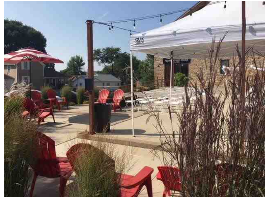
White 10' X 20' "Pop Up Tent" Option