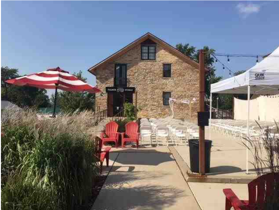
Outdoor Ceremony Seating