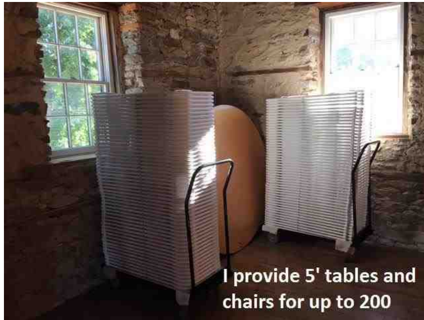
I provide 5' tables and chairs for up to 200