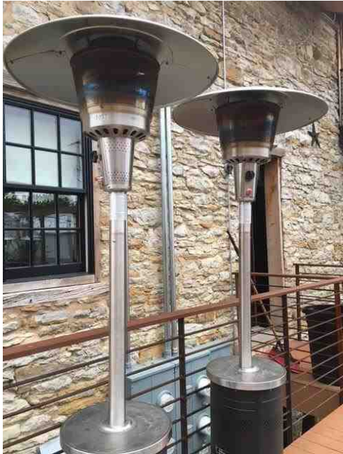
Commercial Patio Heaters (2) Option