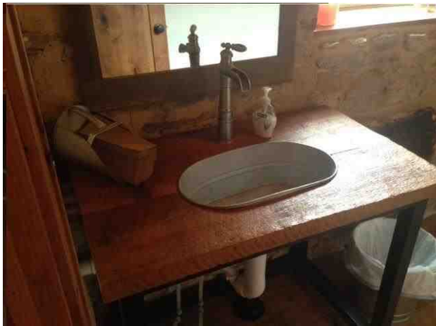
4 Rest Rooms