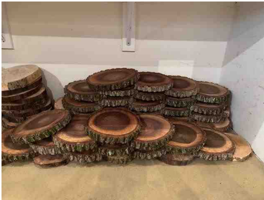
Newly cut each year live edge centerpieces