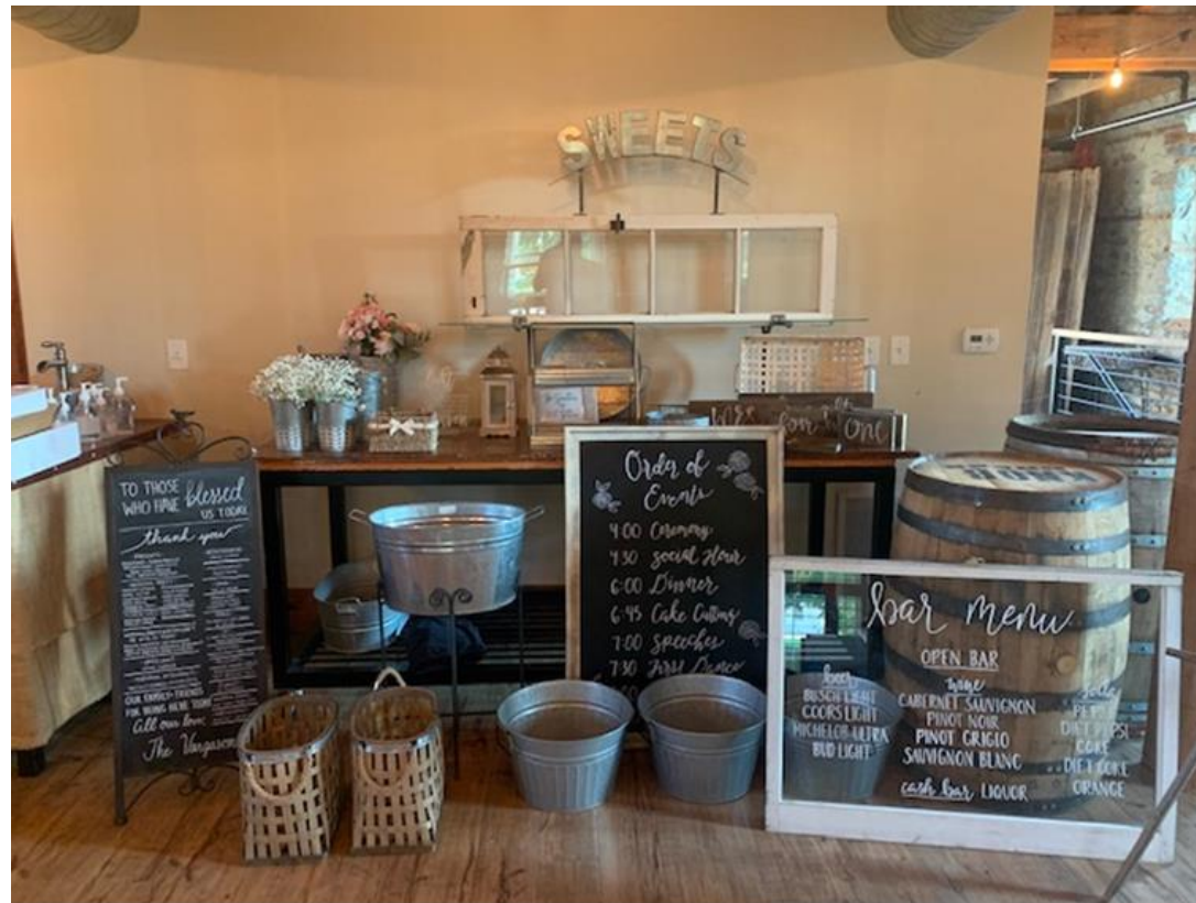
Our Latest Complimentary Decorating Accessories