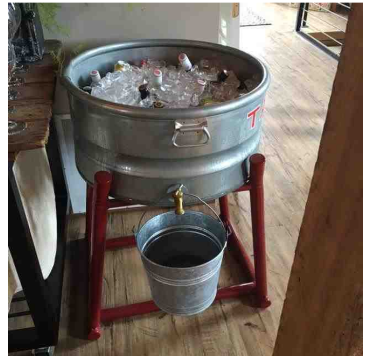
Large Galvanized Tubs "Self-Serve" eliminates bartenders' expense just grab and go