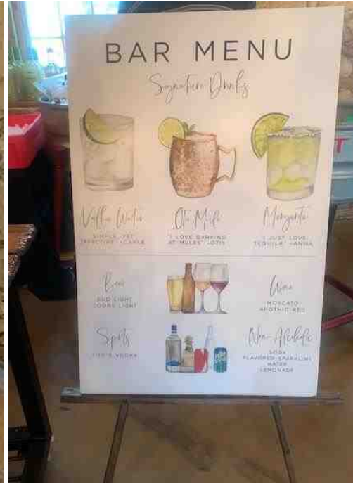
BAR MENU TEMPLATE https://templett.com/design/v2 USER: al@palmerhousestable.com PW: Palmer22