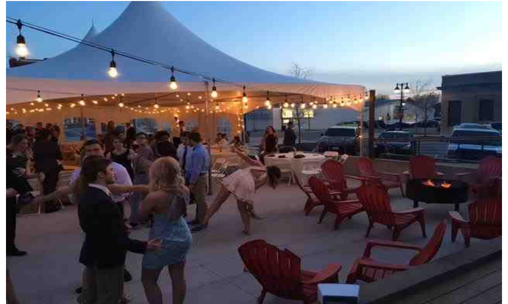
Front terrace and a Bonfire we will build, light, stoke and manage.