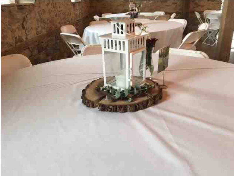
Typical center piece arrangement using all PHS acc.