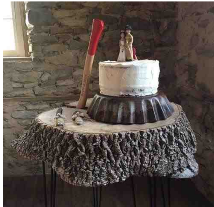
Wood Chunk Table for Deserts