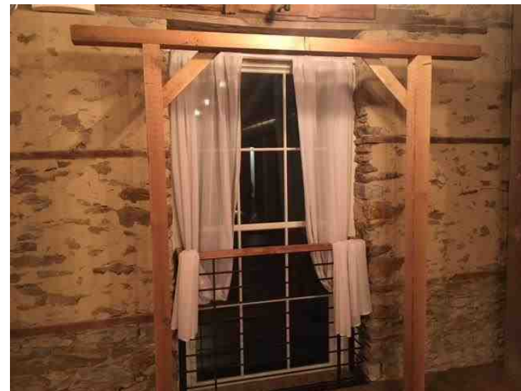
Indoors and Outdoors Cedar Beam Alters (2) you can decorate