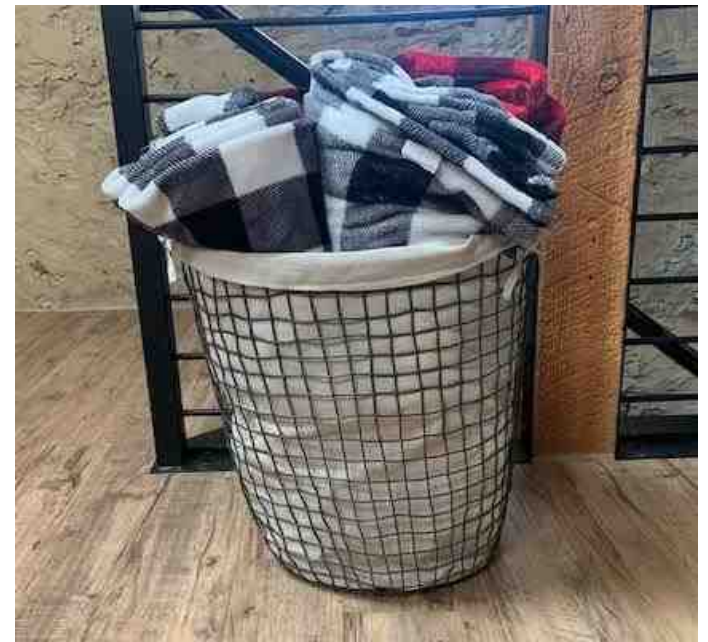
Sitting outside? We got you covered.