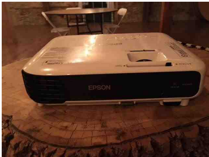
EPSON Projector and Screen

For use indoor ceremony and speeches, or outdoor on the terrace during ceremony.