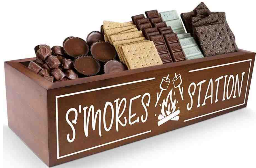
After Dark Bonfire and S'mores ...we even provide the S'more sticks and S'more Station box! (Chocolate, Marshmallows, Graham Crackers not included)