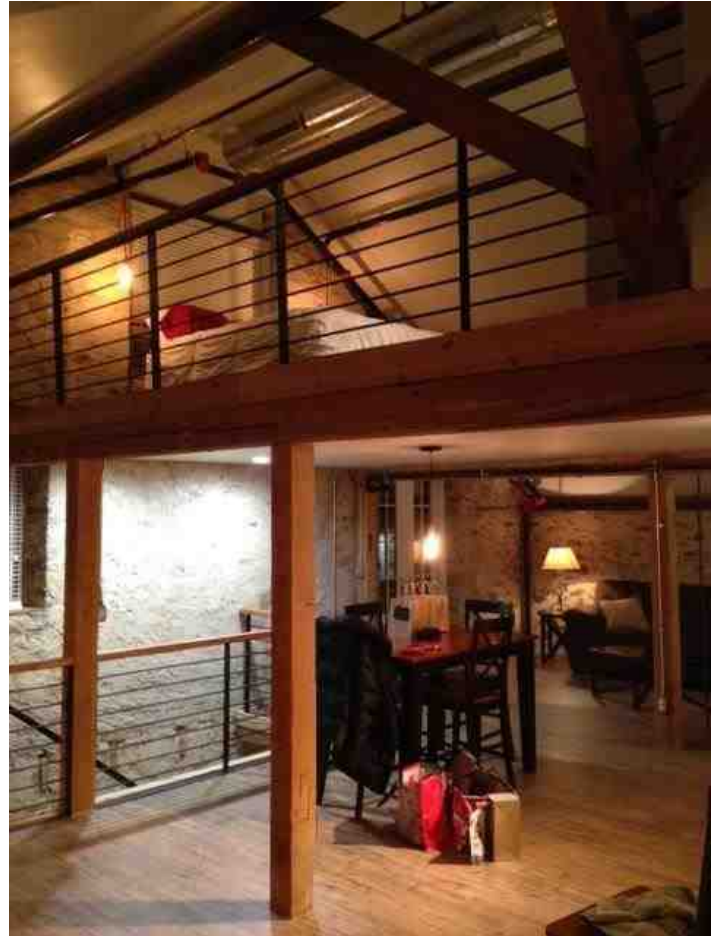
Hall Entry, Dining & Loft

Book the Hay Loft for Friday and Saturday nights and move in on Friday morning and start decorating around your schedule not ours!!