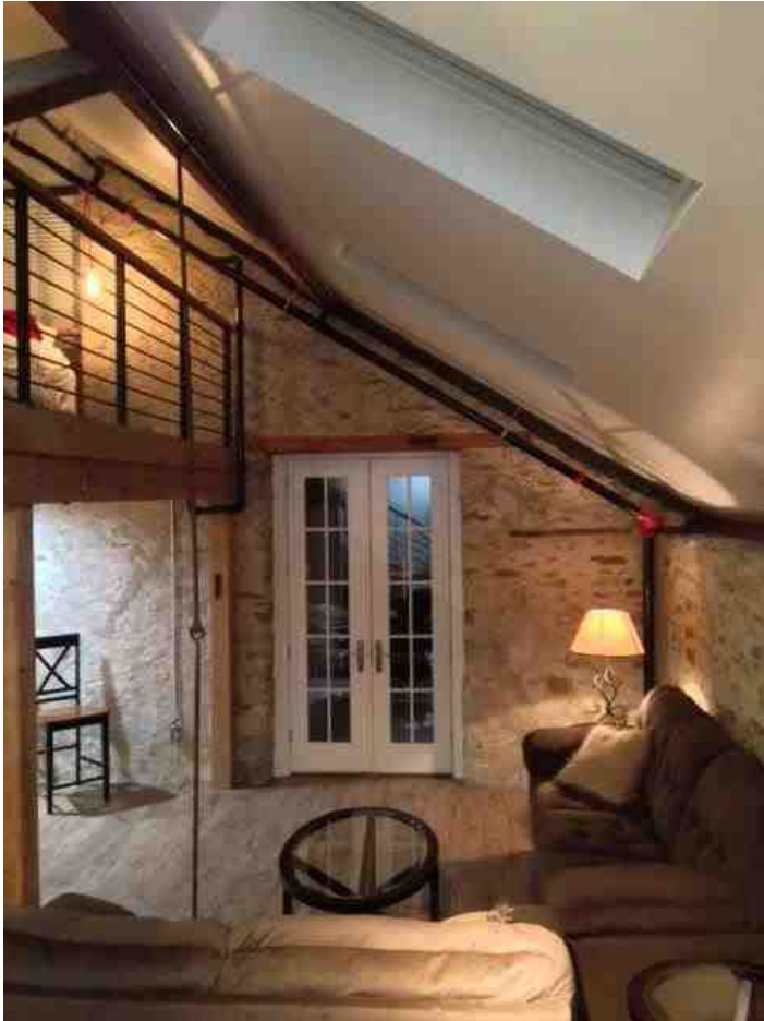
Great Room & Juliet Balcony