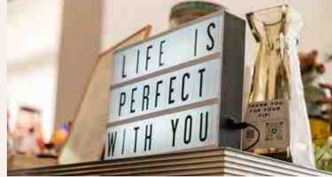
Light box sign with a Special Caption