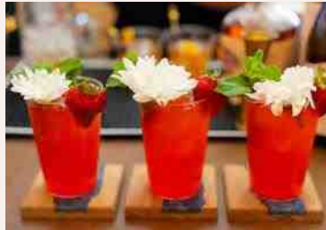
♥ Vodka Strawberry Fizz