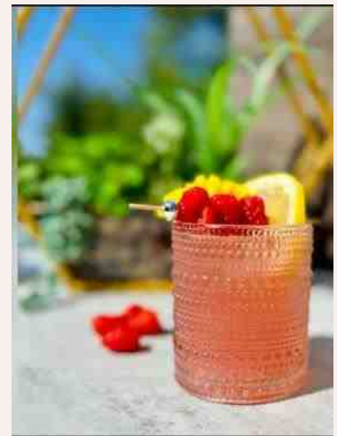
♥ Vodka or Gin Raspberry Lemonade