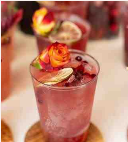
♥ Pomegranate Mojito