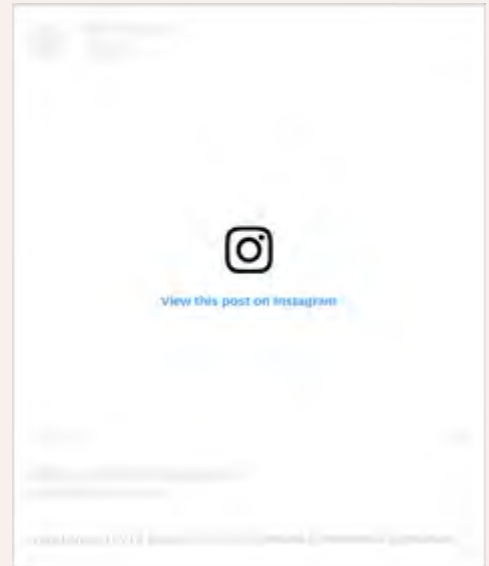
Airplane Flight Shots