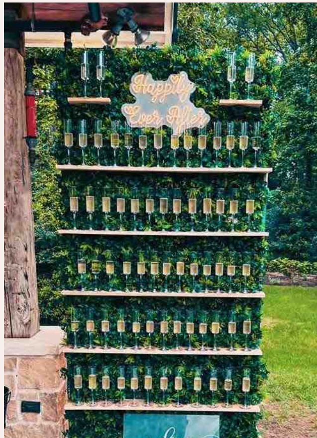
Champagne Wall with Acrylic cups