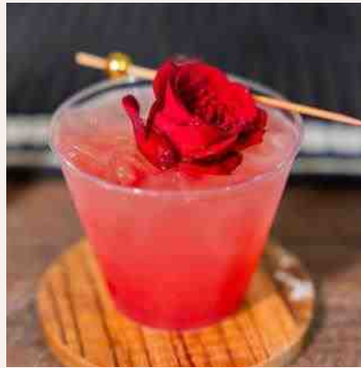
♥ Vodka Raspberry Lemonade