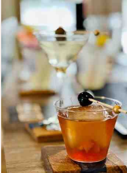
Dirty Martini and Old Fashioned