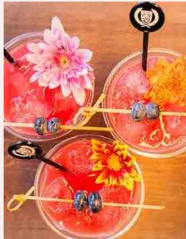
♥ Blueberry Passion fruit Margarita