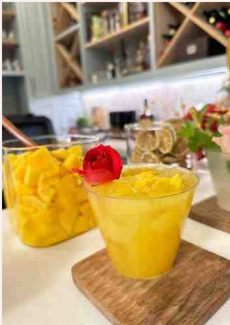
♥ Mango Margarita