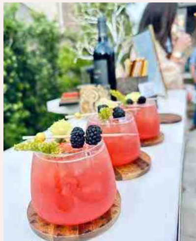
♥ Blackberry Bourbon Ginder