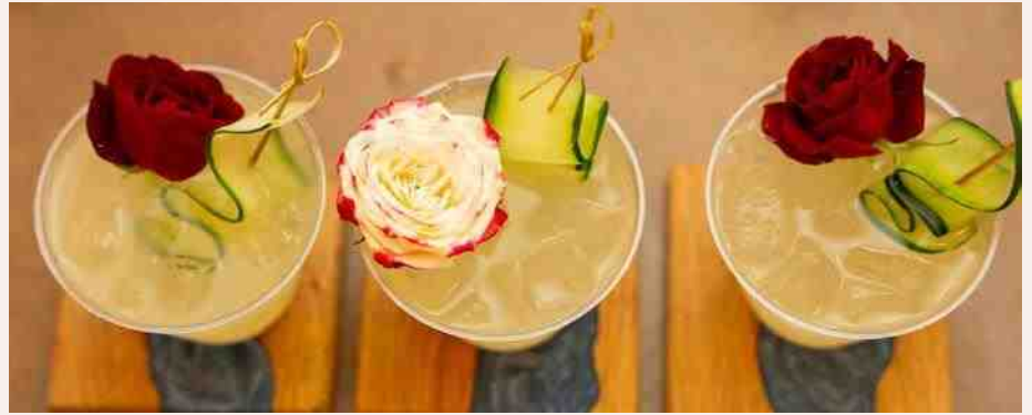
Cucumber Tom Collins