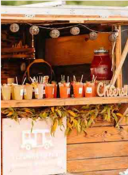
Always ready for guests

♥ Also Available as a Mocktail (non-alcoholic version)