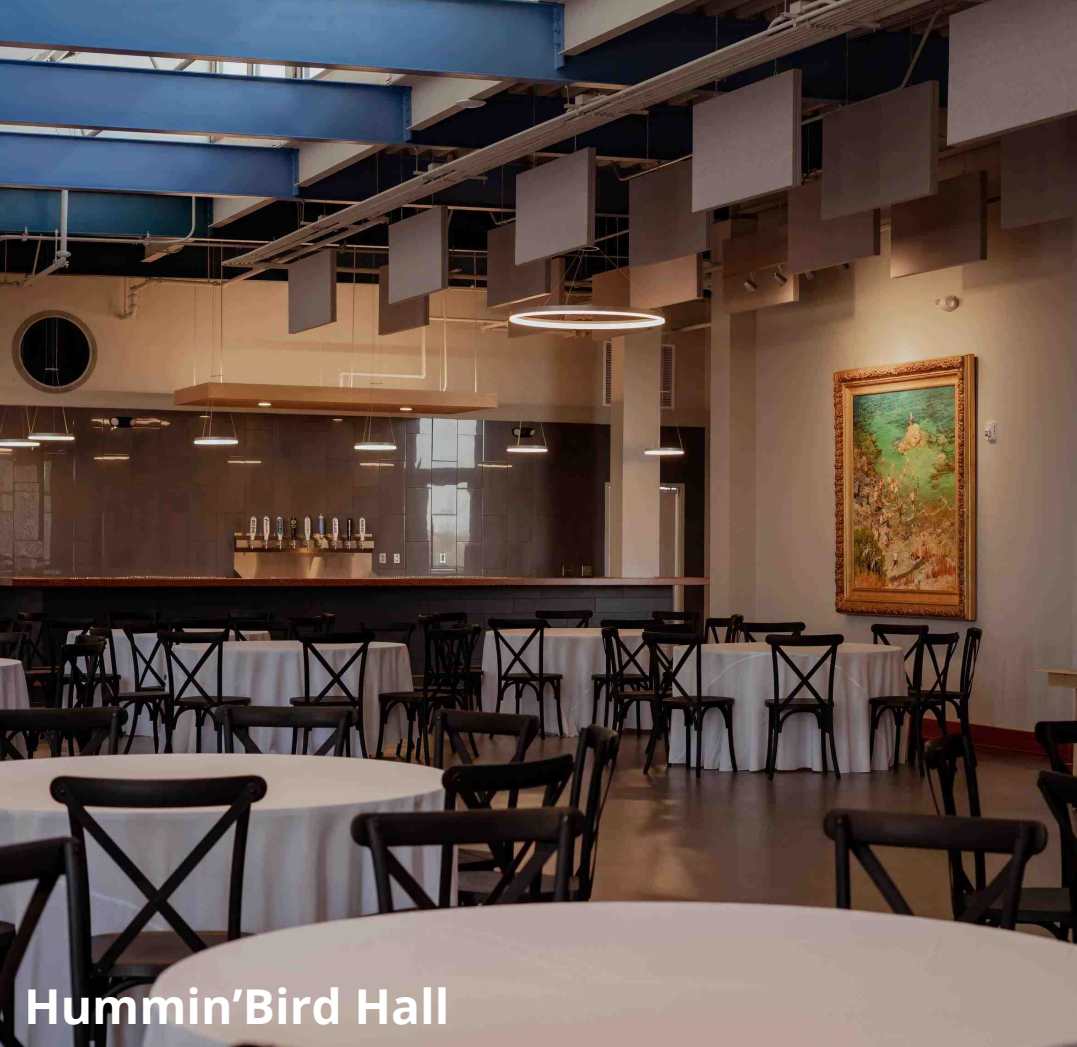
Hummin' Bird Hall