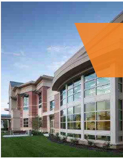
The Conference Center at Midwest Genealogy Center 3440 S. Lee's Summit Road Independence, MO 64055