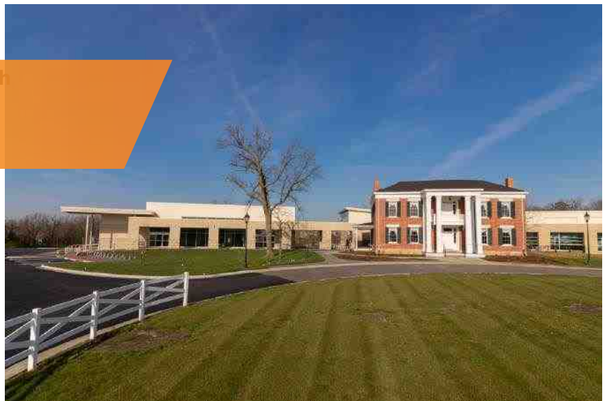
The Auditorium at Woodneath Library Center 8900 NE Flintlock Road Kansas City, MO 64157