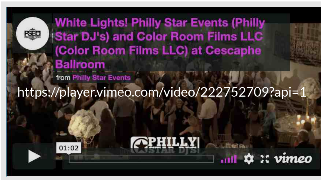
View Event Video Demo - Click Link On The Photo