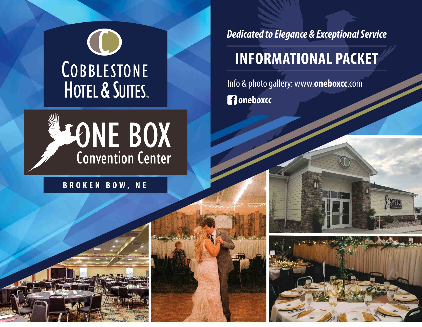
A PRIME VENUE FOR Meetings • Receptions • Reunions • Weddings & Celebrations

Thank you for considering One Box Convention Center for your upcoming event! We look forward to providing an outstanding experience. We will set up a meeting to discuss details such as set-up diagram, linen colors and styles, etc.