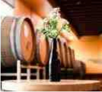
BOTTLES (12OZ) $5 EACH

Booking with us means enjoying the fun part of your event while we take care of the rest. We welcome you to make the space yours with a variety of decor!