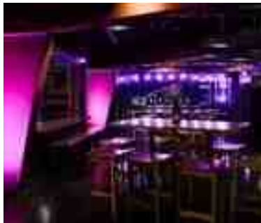
PURPLE/PINK LIGHTING FREE