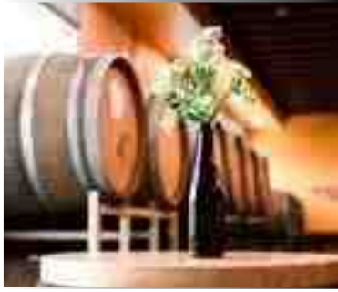
HOWLERS (32OZ) $5 EACH