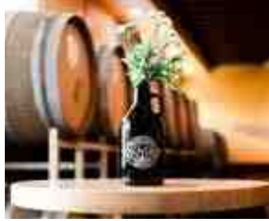
GROWLERS (64OZ) $5 EACH