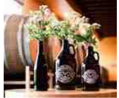
SET OF THREE $10 PER SET