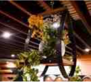
HANGING METAL CHANDELIERS $15 EACH (5 TOTAL AVAILABLE)