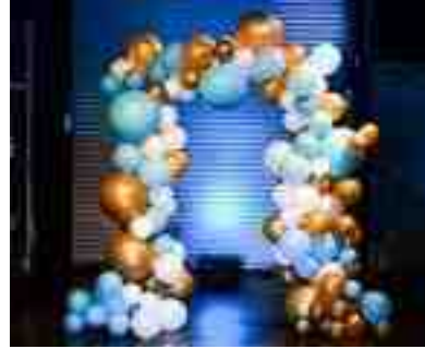
BALLOON ARCH PRICING VARIES