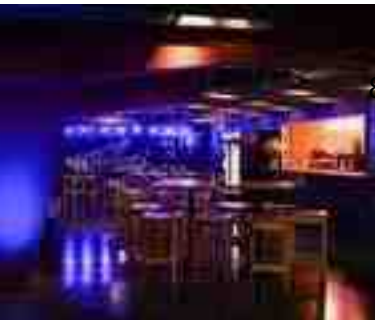
BLUE LIGHTING FREE