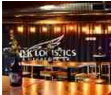
YELLOW LIGHTING FREE