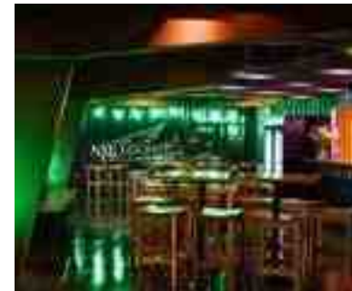
GREEN LIGHTING FREE