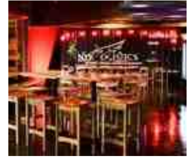
RED LIGHTING FREE