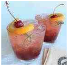
Traditional Old Fashioned