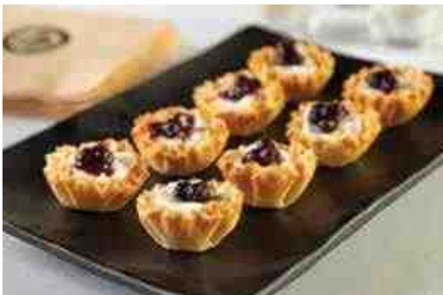
Moroccan Glazed Salmon Skewers (above right) and Blueberry Goat Cheese Tartlets (above)

G : Gluten Sensitive except as noted VG : Vegan