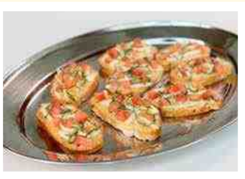
Antipasto Skewers (above right) and Roasted Garlic & White Cheddar Bruschetta (above)

G: Gluten Sensitive except as noted VG: Vegan