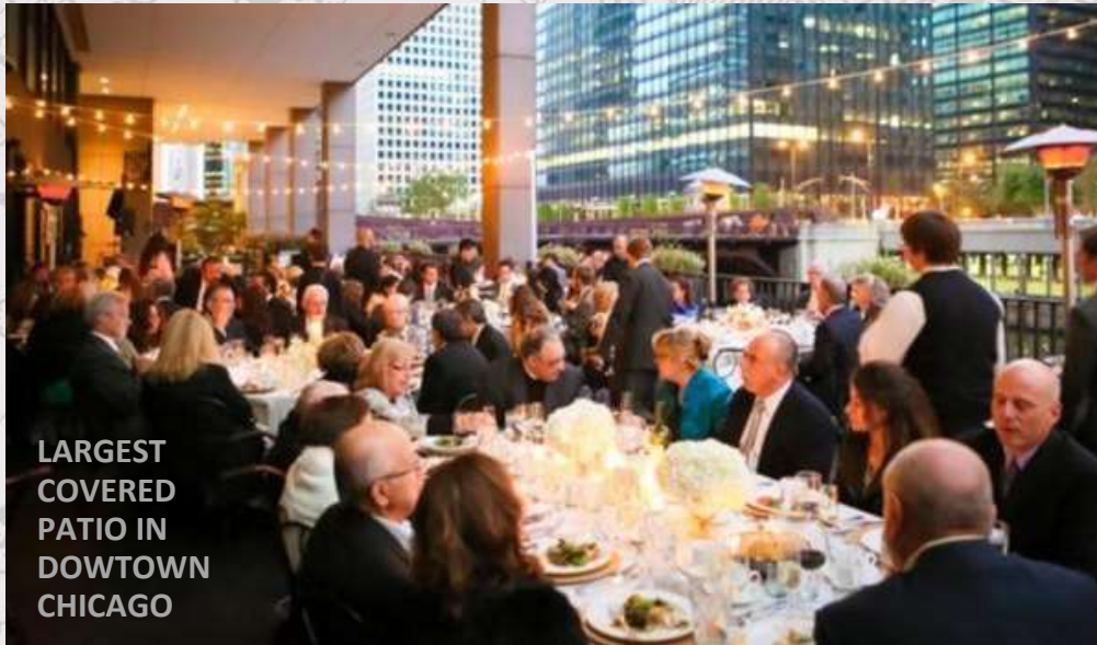
LARGEST COVERED PATIO IN DOWNTOWN CHICAGO

T ucked along the banks of the Chicago River, Rivers Restaurant is a spectacular place to wed, dine, and celebrate with all of your family and friends. Perfectly positioned within the financial district of Chicago, this downtown venue presents an urban wedding and reception setting for brides and grooms seeking a lively city space without the usual urban noise.