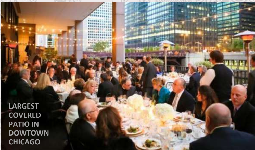
LARGEST COVERED PATIO IN DOWNTOWN CHICAGO

T ucked along the banks of the Chicago River, Rivers Restaurant is a spectacular place to wed, dine, and celebrate with all of your family and friends. Perfectly positioned within the financial district of Chicago, this downtown venue presents an urban wedding and reception setting for brides and grooms seeking a lively city space without the usual urban noise.