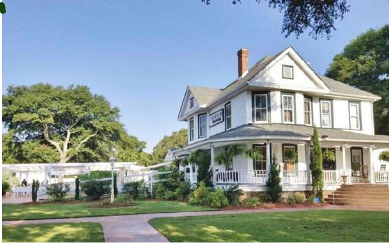
Historic 1910 Victorian Estate

The picture-perfect setting for your Private Event