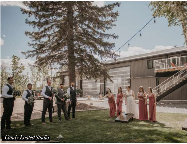
Candy Coated Studio