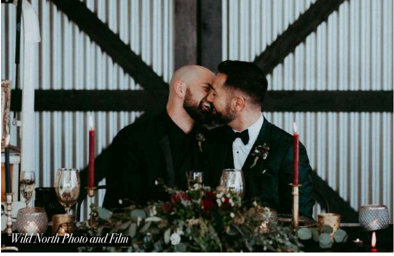
Wild North Photo and Film