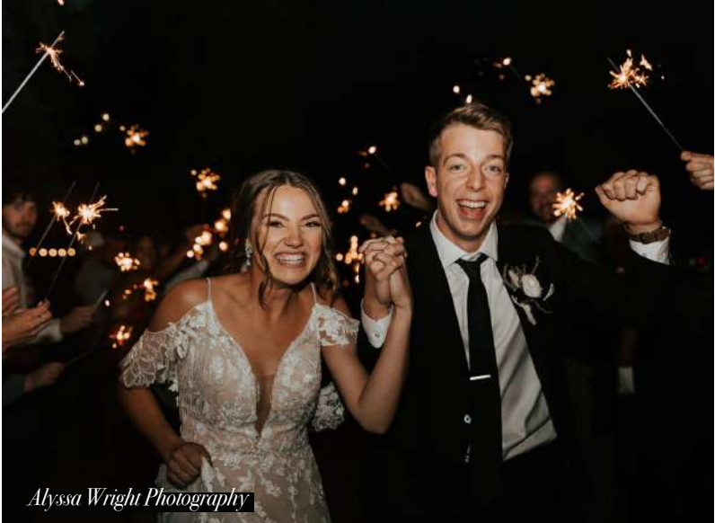
Alyssa Wright Photography

Only 20 dates available per season so book early!