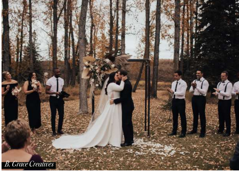
B. Grace Creatives