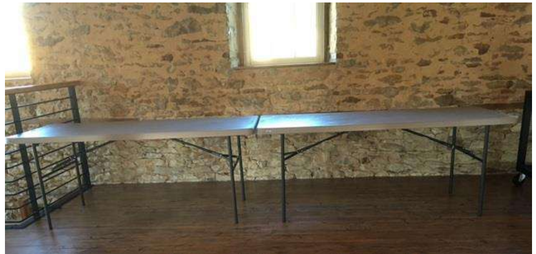
6'-Buffet Tables (5)