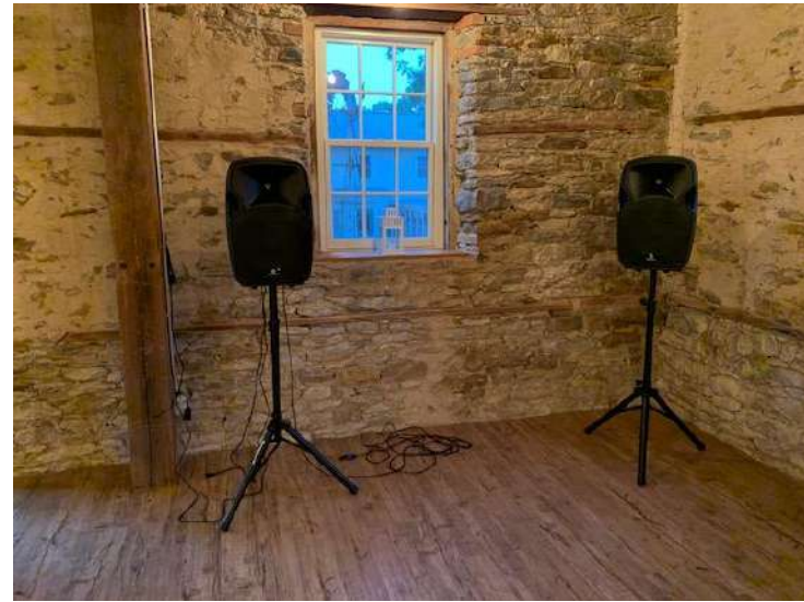
PRORECK PARTY 12 Portable Professional PA Speaker System (New July 2019) Bluetooth/USB/SD Card Reader FM Radio/Remote Control/Speaker Stand

For use indoor ceremony and speeches, or outdoor on the terrace during ceremony.