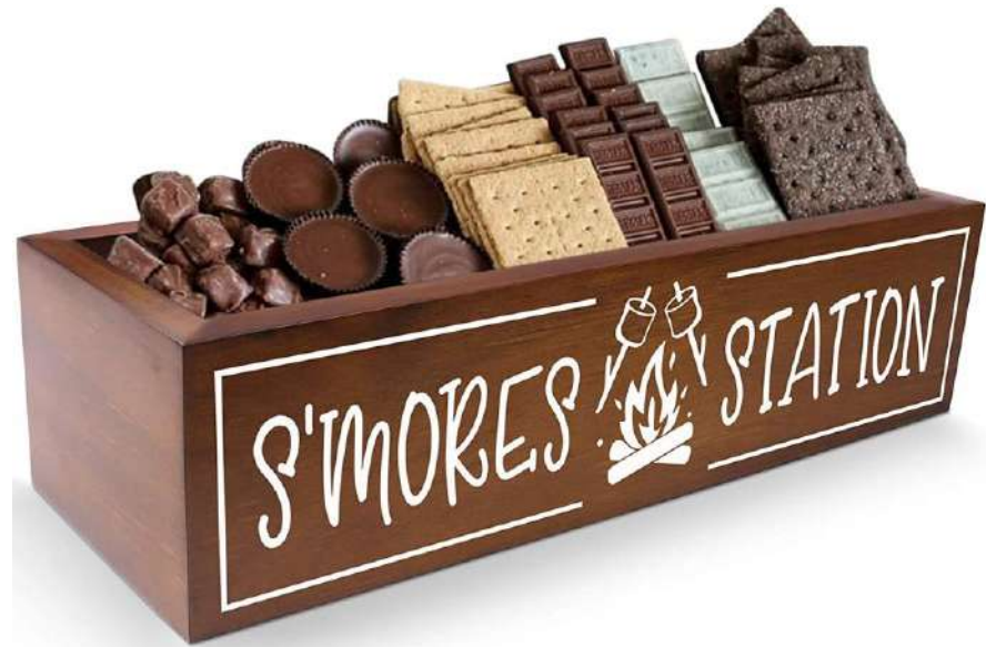
After Dark Bonfire and S'mores ...we even provide the S'more sticks and S'more Station box! (Chocolate, Marshmallows, Graham Crackers not included)