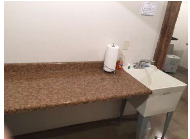
Prep Kitchen-Oven range-freezer-refrigerator-counter space and tub sink.