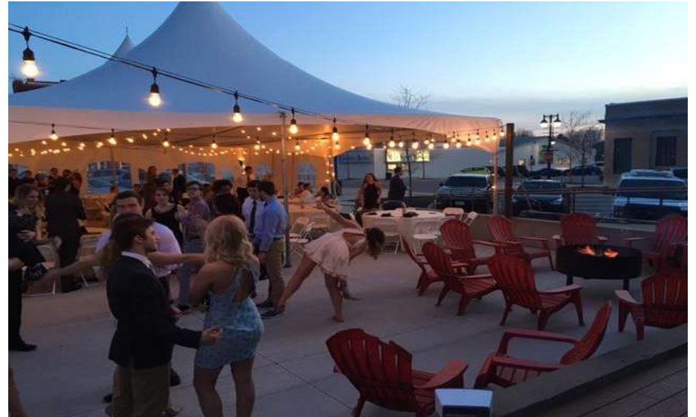
Front terrace and a Bonfire we will build, light, stoke and manage.