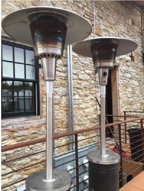
Commercial Patio Heaters (2) Option