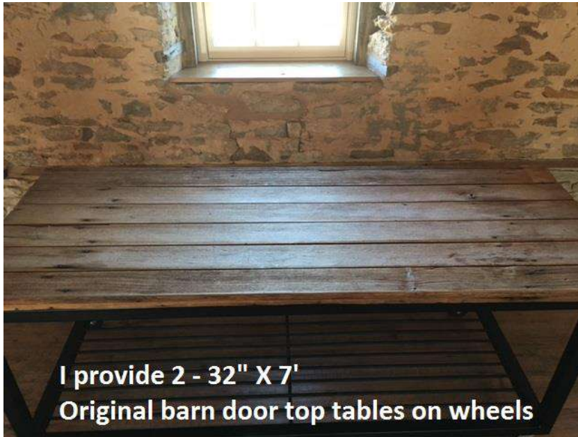
I provide 2 - 32" X 7' Original barn door top tables on wheels