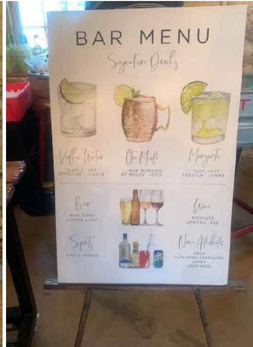
BAR MENU TEMPLATE https://templett.com/design/v2 USER: al@palmerhousestable.com PW: Palmer22