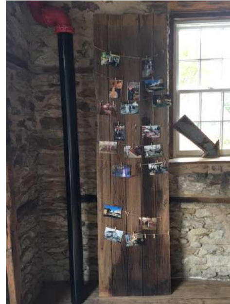
Entry barn door picture pinup