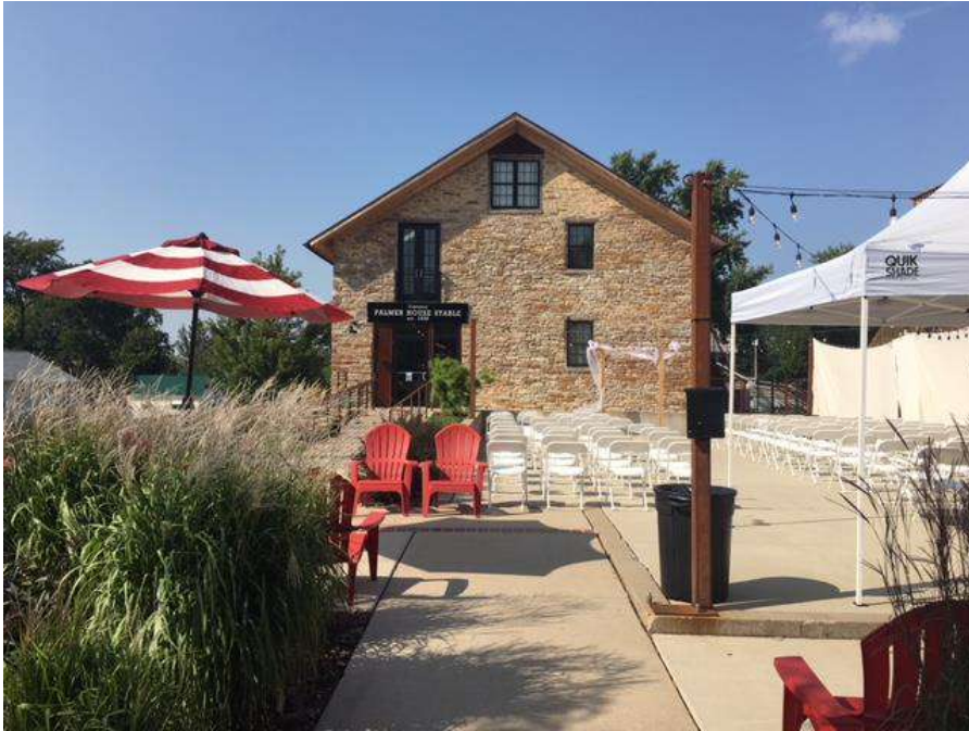
Outdoor Ceremony Seating