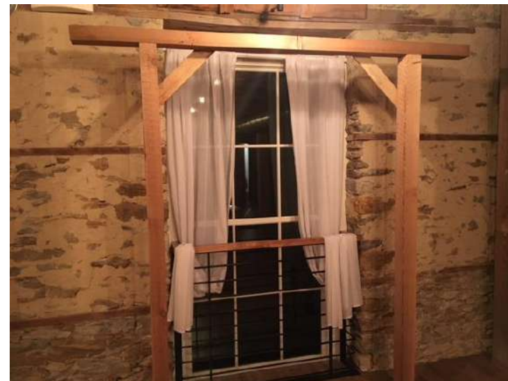
Indoors and Outdoors Cedar Beam Alters (2) you can decorate