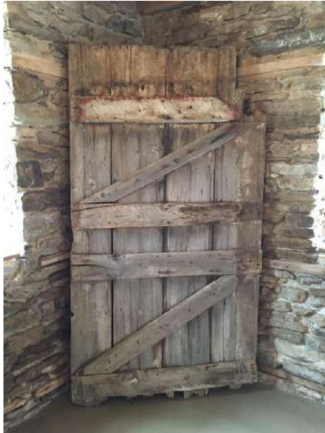
Rustic Back drop for photo booth