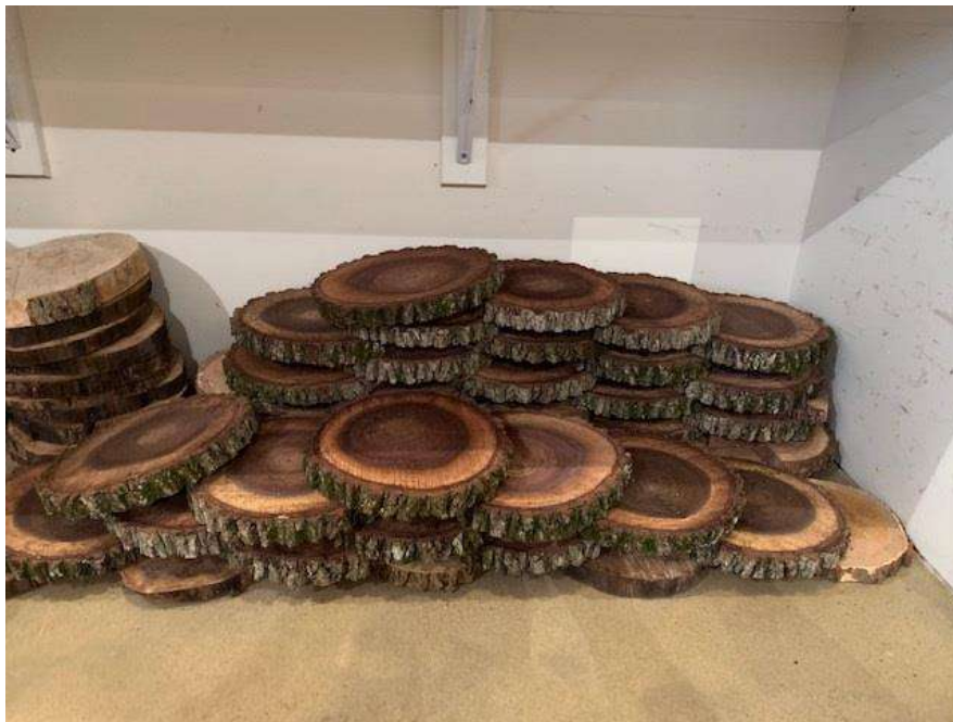
Newly cut each year live edge centerpieces