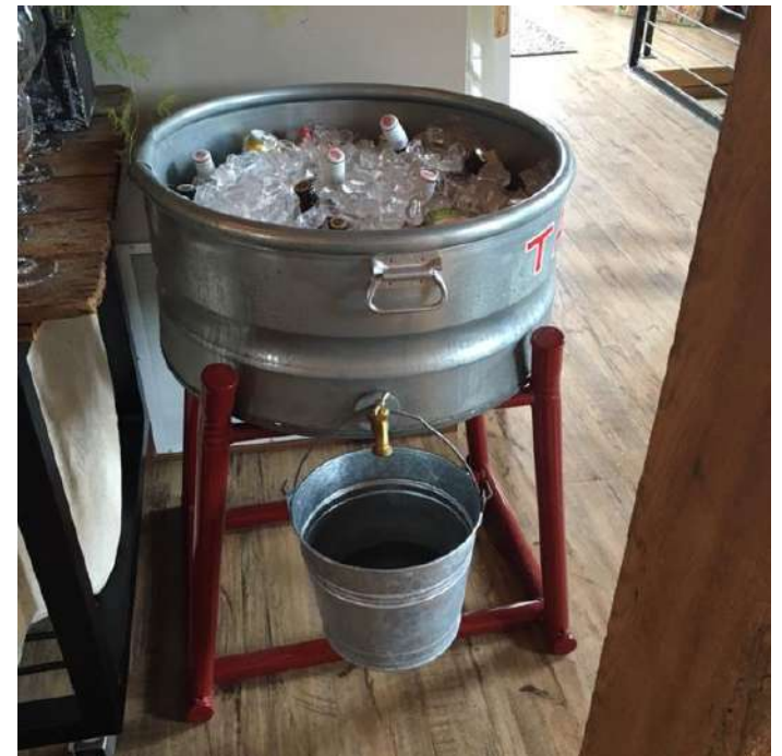
Large Galvanized Tubs "Self-Serve" eliminates bartenders' expense just grab and go