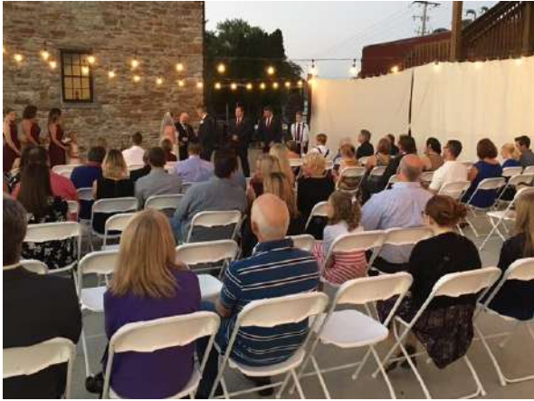
Outside Terrace Ceremony with String Lights