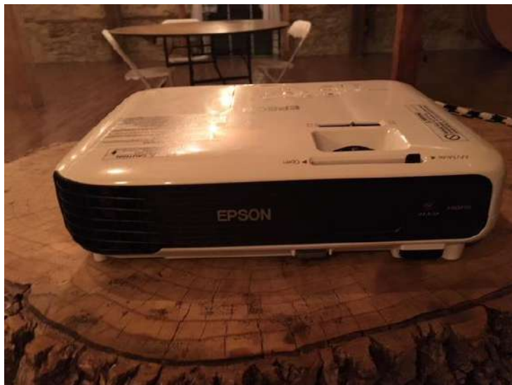
EPSON Projector and Screen

For use indoor ceremony and speeches, or outdoor on the terrace during ceremony.