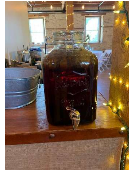
5 water, tea, and lemonade glass dispensers