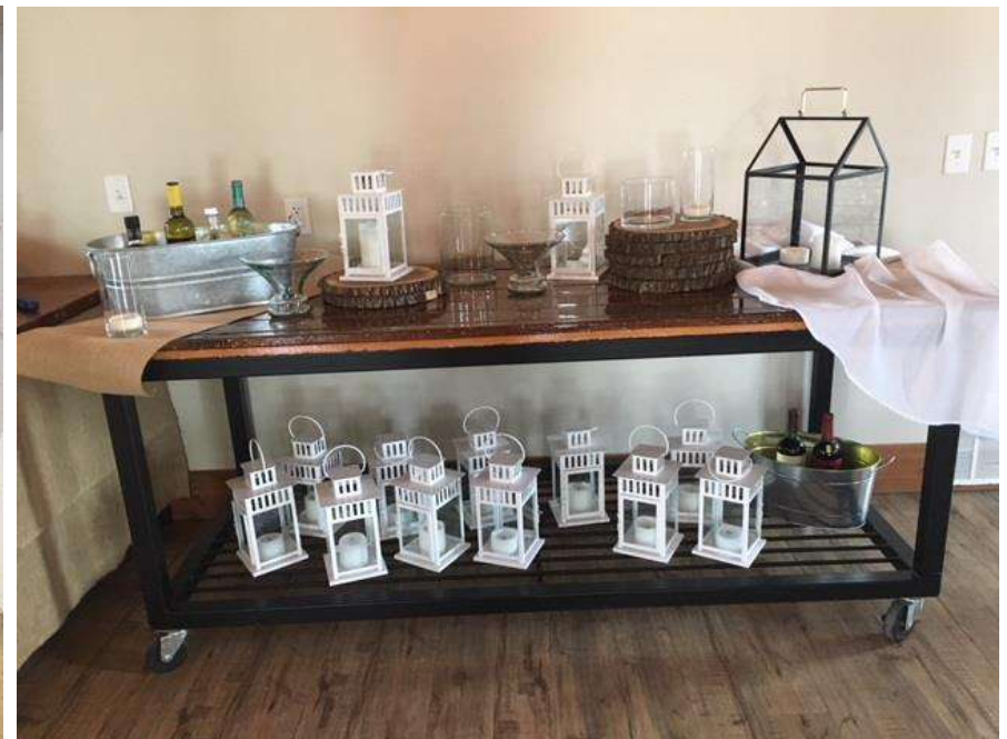
Various accessories you can use