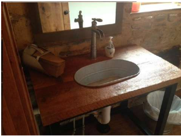
4 Rest Rooms