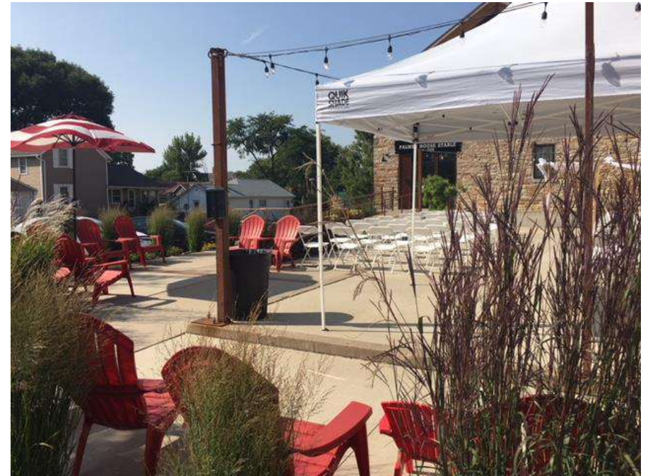
White 10' X 20' "Pop Up Tent" Option