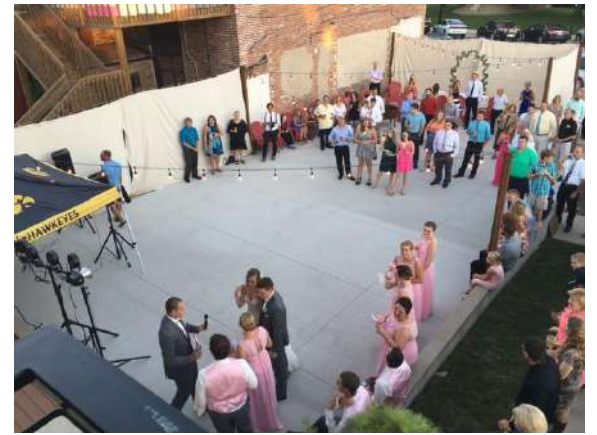
Music Lights and Dancing under the stars