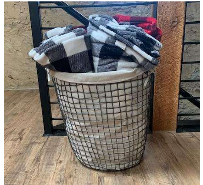
Sitting outside? We got you covered.