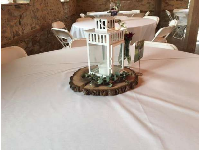
Typical center piece arrangement using all PHS acc.