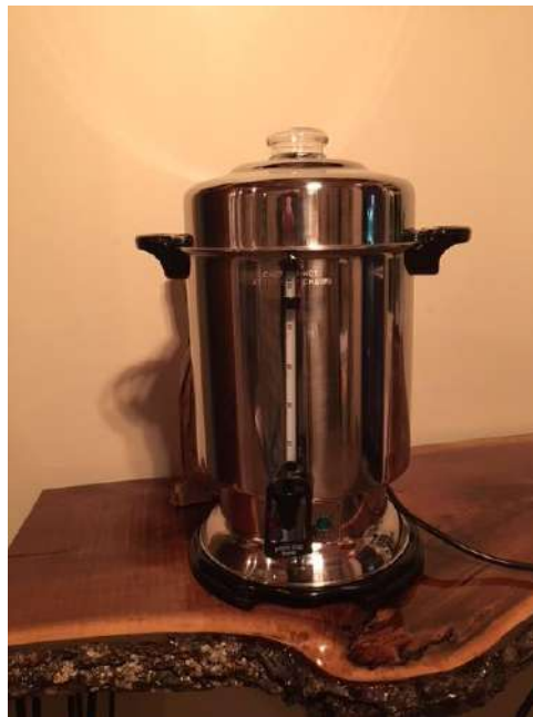
60 Cup Coffee Maker