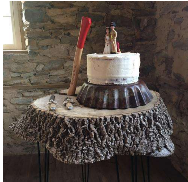
Wood Chunk Table for Deserts