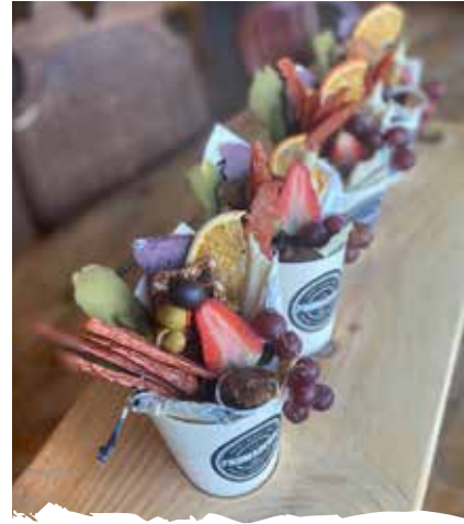
~ INDIVIDUAL CHARCUTERIE CUPS ~ $17 per person