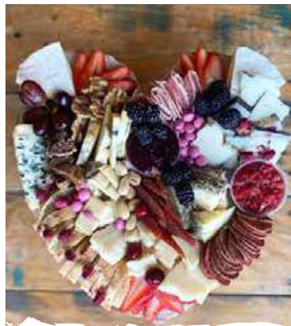
~ HEART BOARDS ~ $100

Impress your guests and add a unique touch to your wedding!