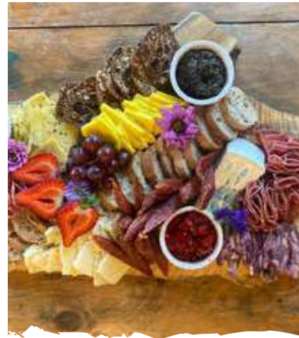
~ CHARCUTERIE BOARDS ~ $80 & UP