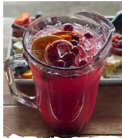
~ SANGRIA BAR ~ $9 per person