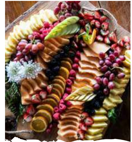
~ FRUIT OR VEGGIE BOARDS ~ $60 Small | $80 Medium | $100 Large