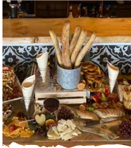
~ GRAZING TABLES ~ $25 per person