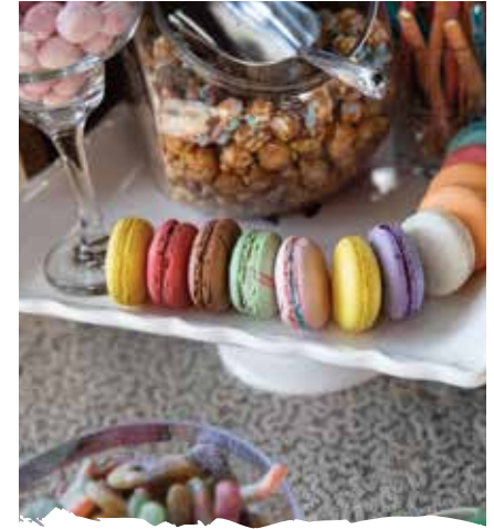
~ CANDY BAR ~ Sweet tooth - $5 per person Sugarplum - $6.50 per person Want it all - $8 per person