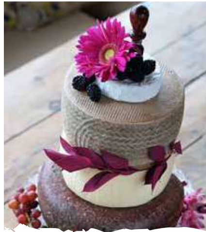
~ CHEESE WHEEL CAKES ~ $250 & UP