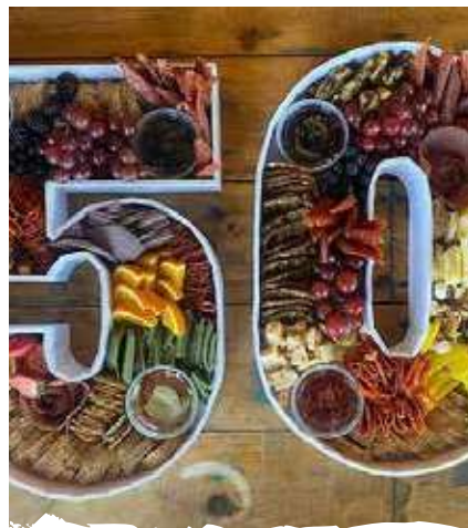
~ MESSAGE BOARDS ~ $50 per 1' Tall Character $75 per 1.5' Tall Character $125 per 2.5' Tall Character