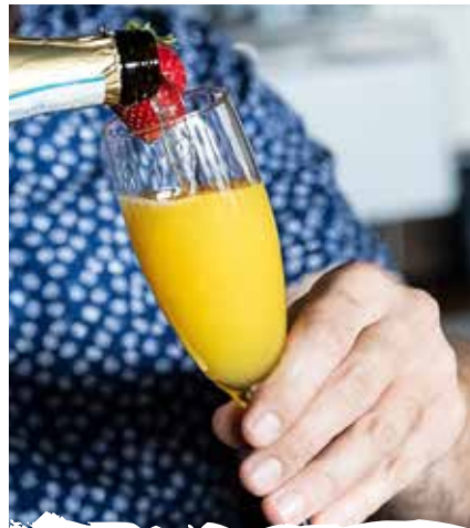
~ MIMOSA BAR ~ $9 per person