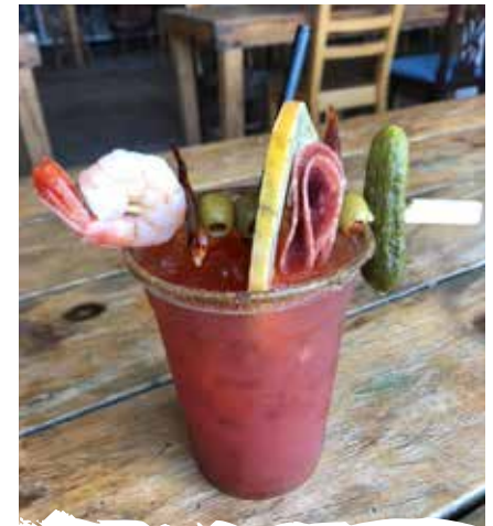
~ CAESAR BAR ~ $11 per person