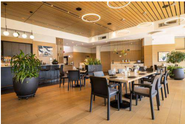
TABLE NINETEEN BAR ROOM

*approx. size: 1,300 sq ft, maximum capacity 85