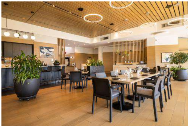
TABLE NINETEEN BAR ROOM

*approx. size: 1,300 sq ft, maximum capacity 85