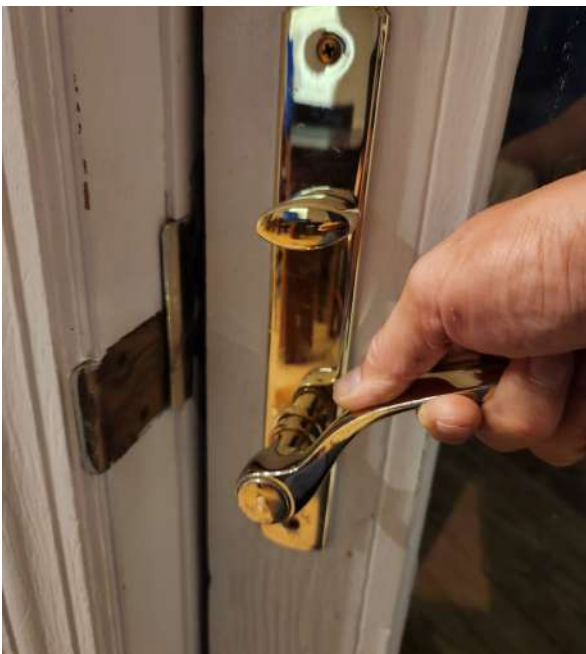
Lift the handle up and turn lock!