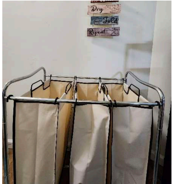
Place all dirty linens and towels in this laundry hamper.