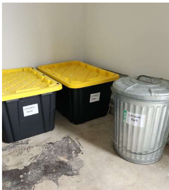
Chicken feed located in garage