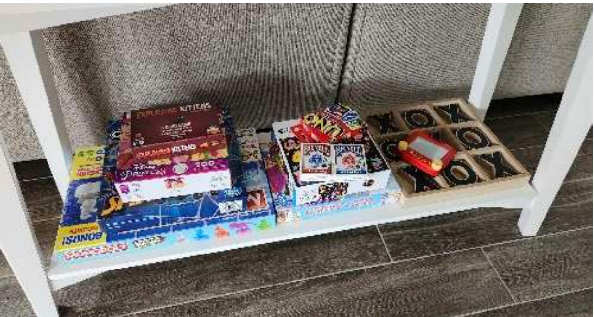
An assortment of games are available for your enjoyment. Although we do not provide you with R/C toys, remote controlled boats, planes, helicopters, etc and kites are ideal for the Lake Estate. With 13 acres to play, this is your chance to enjoy toys that require big spaces.