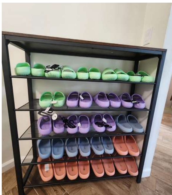
Please do not wear your shoes inside the house. Comfortable slippers are provided for you while you walk around inside the house. Do not wear the slippers outside except the front patio and back patio.