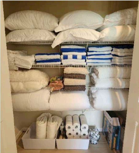
The Supply Closet located on the 2nd floor has everything you need for a comfortable stay. Please take what you need.