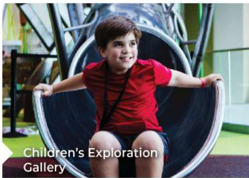
Children's Exploration Gallery