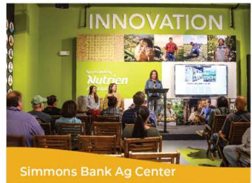
Simmons Bank Ag Center