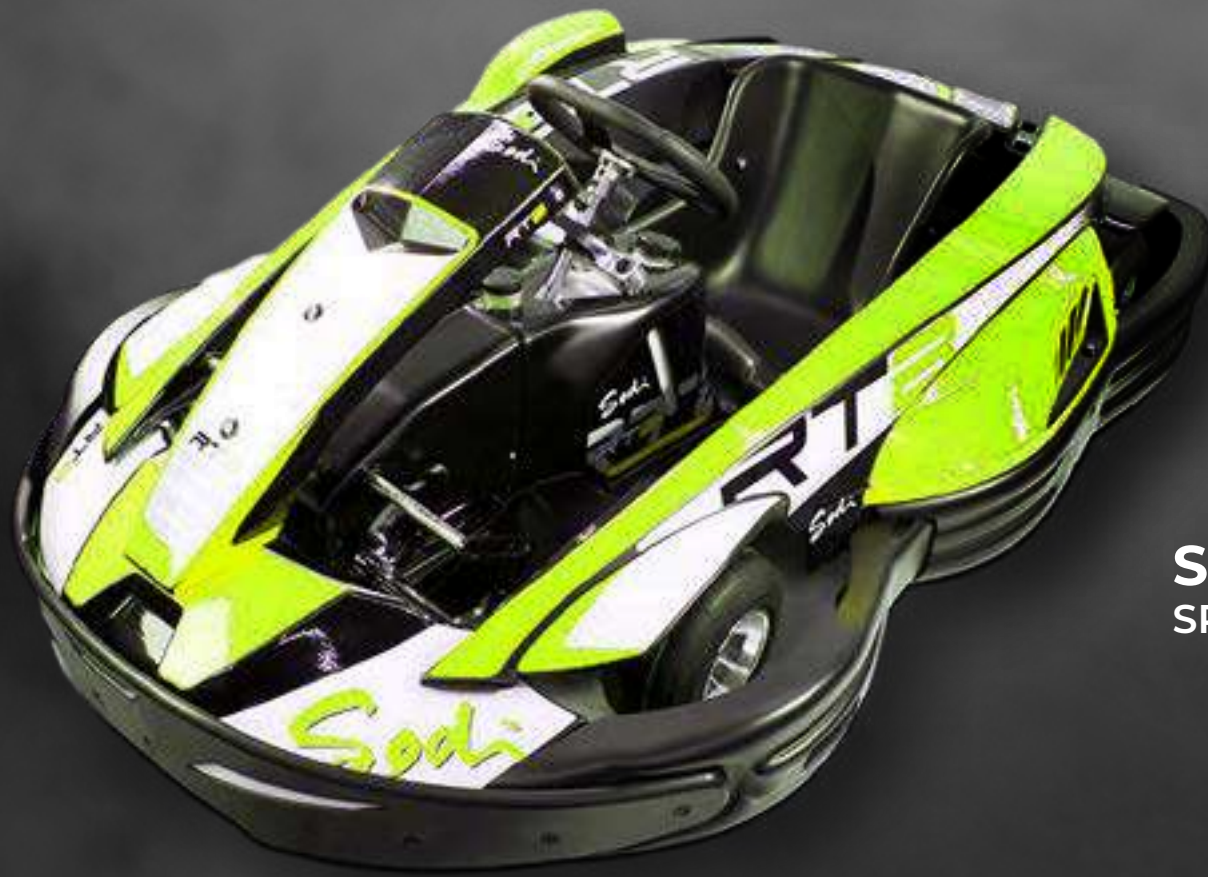
SODI RT8 KARTS SPEEDS OF UP-TO 70KM/H

Our 11-turn road course designed to challenge your nerve and skill. Here, capability, speed and guts is where the bravest and the best compete for top times.