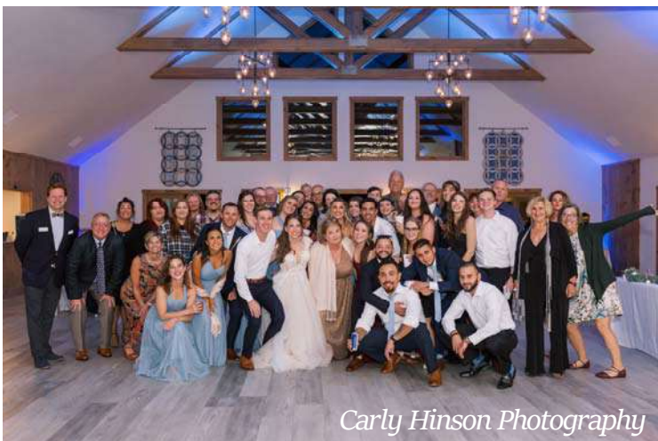
Carly Hinson Photography