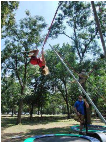
LONE STAR BUNGEE TRAMP (2 hour minimum) $350.00 per hour