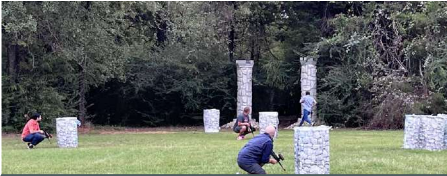
Capture the Castle-Outdoor Laser Tag (2 hour minimum) $250.00 per hour