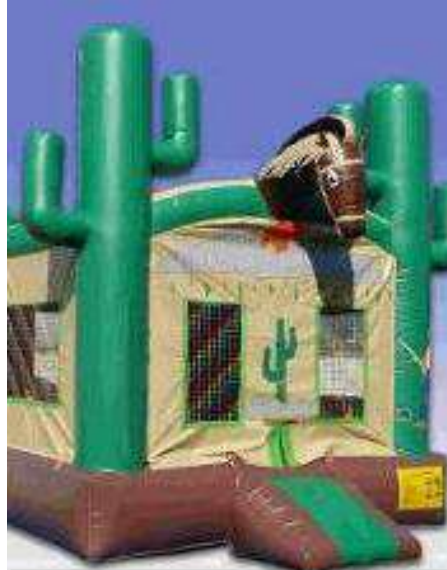
BOUNCE HOUSE (4 hours) $300.00