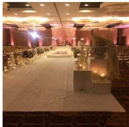
Grand Ballroom Ceremony