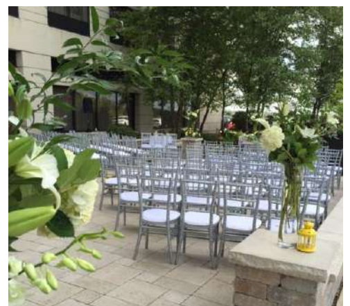
Naper Patio Ceremony