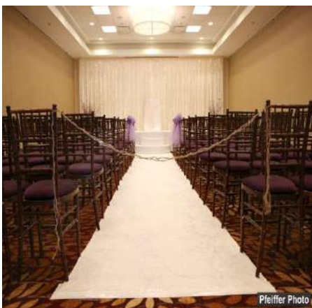
Naper Ballroom Ceremony