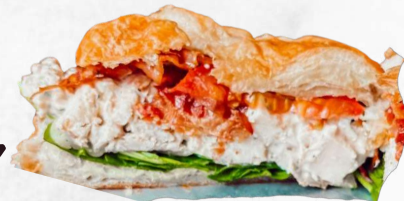
Allison's Chicken Salad