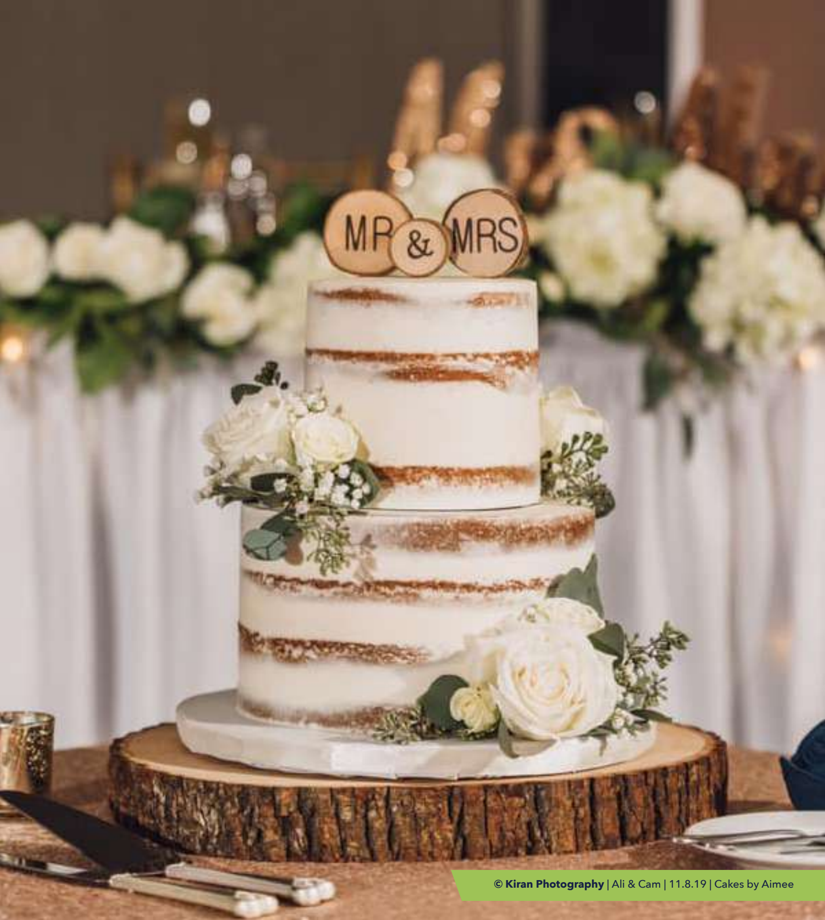
Ali & Cam | 11.8.19 | Cakes by Aimee