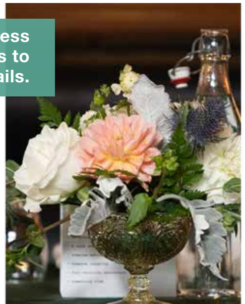
Table Arrangements .....$43 - $79