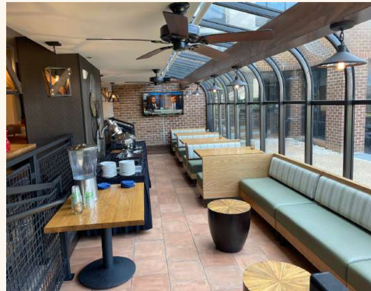
ATRIUM WINDOW Semi Private Event Space Capacity: 25 Guests Seated