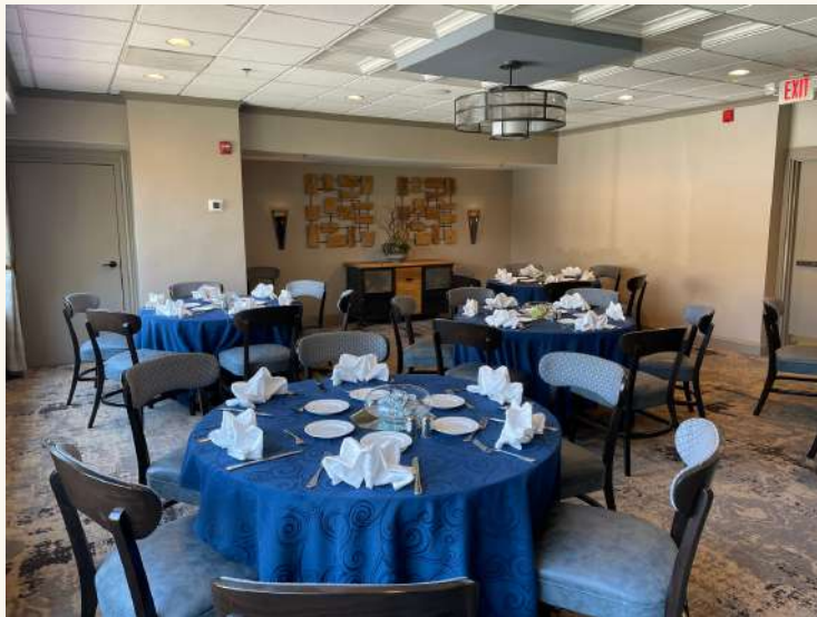
OVER LOOK Private Event Space Capacity: 30 Guests Seated

Tyson's Social Tavern indoor and outdoor Private and Semi Private Event spaces. Tysons Social Tavern Food and Beverage minimum is $1000 with a $500 deposit that will be used towards the final check.