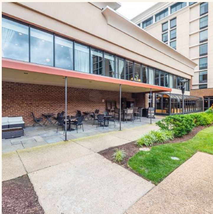
PATIO AWNING Semi Private Event Space Capacity: 50 Guests Standing/ 40 Seated