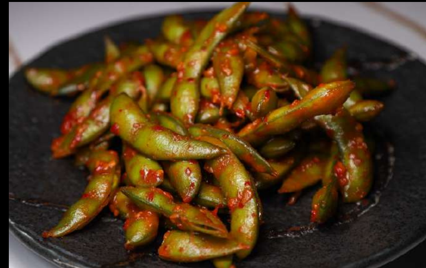
Spicy Garlic Edamame