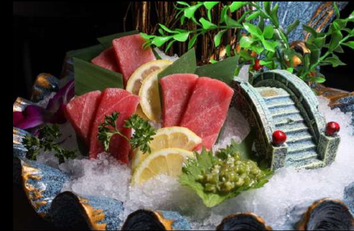
Bluefin Tuna Sashimi