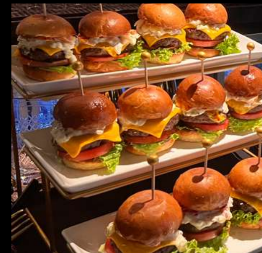
Golden Wagyu Slider