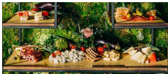
BISCUITS + BERRIES

Make food and drinks a highlight of your next event and delight your guests with five-star presentation — all without lifting a finger or breaking your budget. Select one (or more) of our preferred catering partners to team up with our in-house production staff and let us take your guests on a culinary journey they'll never forget.