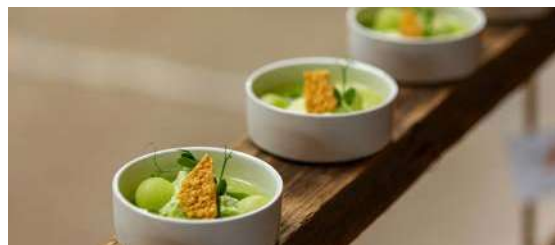
CATERING BY DESIGN