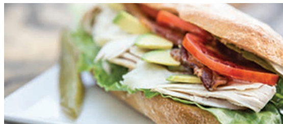
OLIVE & FINCH