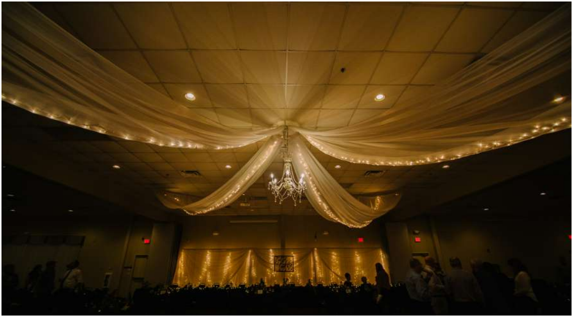
Dance the night away