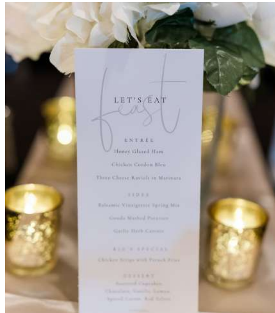
An event to remember