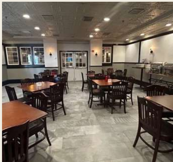
LONG BRIDGE BACK VIEW CAPACITY: 60 STANDING 45 SEATED