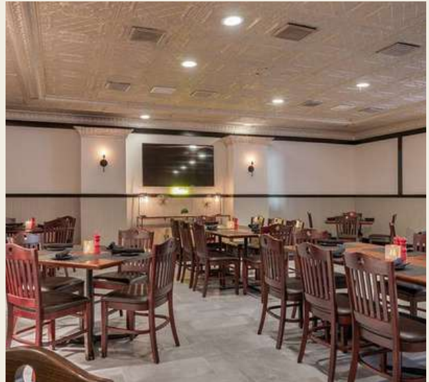
CAPACITY: 60 STANDING 45 SEATED