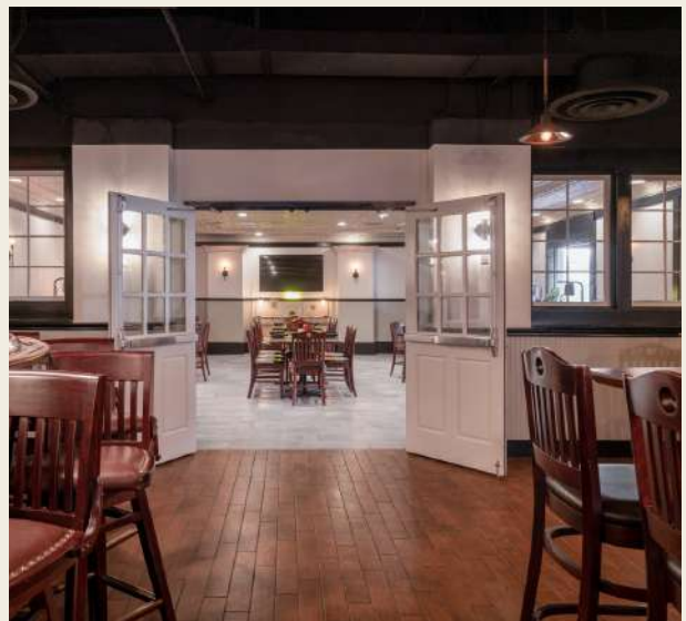
LONG BRIDGE ENTRANCE CAPACITY: 60 STANDING 45 SEATED