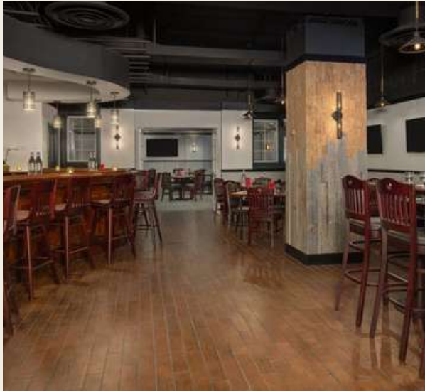
CAPACITY: 70 STANDING 70 SEATED