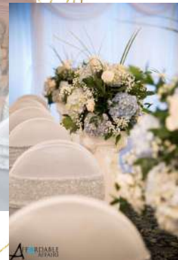
Inside Chapel Set up