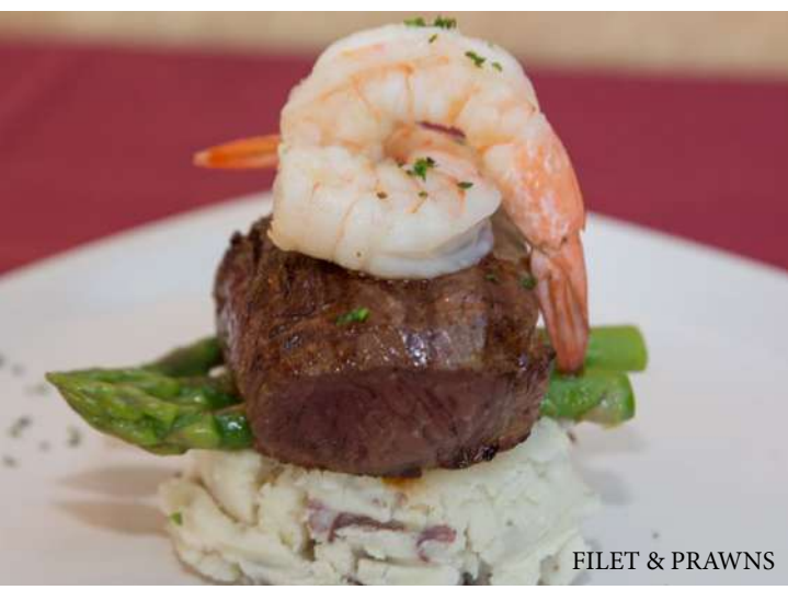
FILET & PRAWNS