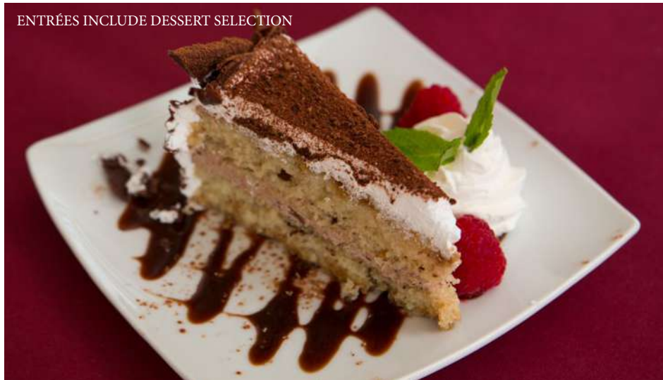
ENTRÉES INCLUDE DESSERT SELECTION