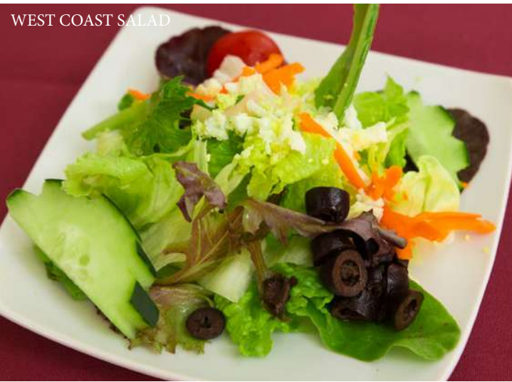
WEST COAST SALAD

Select One Salad for the Plated Lunch & Dinner Entrées