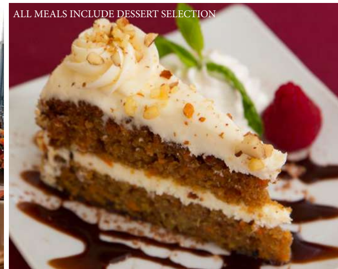
ALL MEALS INCLUDE DESSERT SELECTION

BREAKFAST | BREAKS | LUNCHEONS | DINNERS | BUFFETS | HORS D'OEUVRES | BEVERAGES 700 SOUTH ALMANSOR ST., ALHAMBRA, CA 91801 (626) 570-4600 ALMANSORCOURT.COM