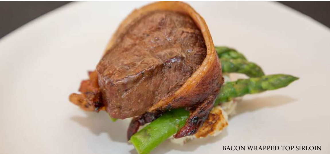
BACON WRAPPED TOP SIRLOIN