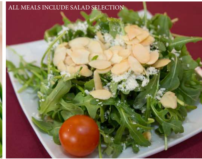
ALL MEALS INCLUDE SALAD SELECTION