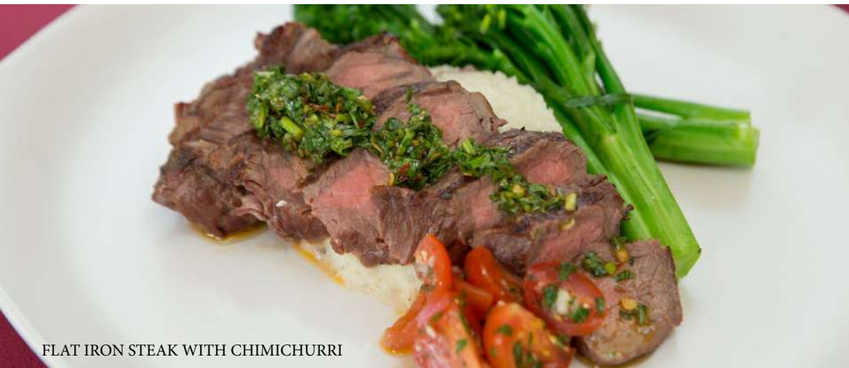
FLAT IRON STEAK WITH CHIMICHURRI

BREAKFAST | BREAKS | LUNCHEONS | DINNERS | BUFFETS | HORS D'OEUVRES | BEVERAGES 700 SOUTH ALMANSOR ST., ALHAMBRA, CA 91801 (626) 570-4600 ALMANSORCOURT.COM