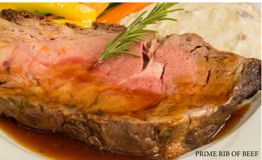
PRIME RIB OF BEEF