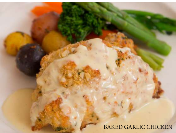
BAKED GARLIC CHICKEN

Entrées Include: Salad Selection, Chef's Selection of Accompaniments & Seasonal Vegetables, Oven Fresh Rolls & Butter, Dessert Selection, Fresh Coffee, Decaf & Tea