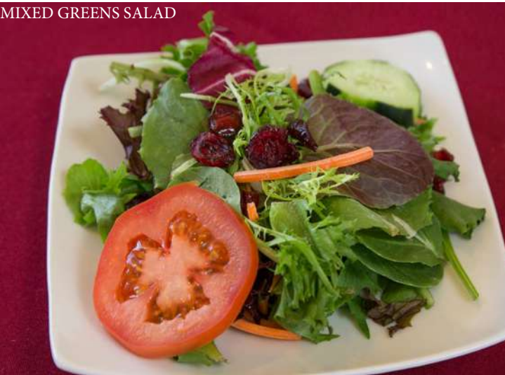
MIXED GREENS SALAD

Chopped Romaine Lettuce Tossed in Grated Parmesan Cheese, Croutons and Tangy Caesar Dressing $0.99 additional per person