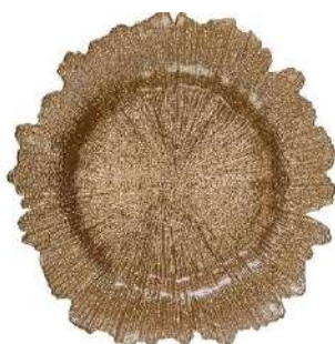
Gold Reef Glass