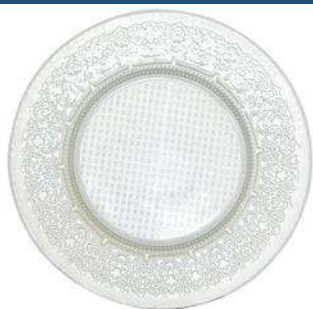
Vintage Pearl Glass