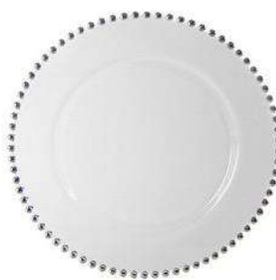
Silver Bead Glass