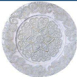
Mandala Silver Glass