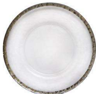
Silver Rim Glass