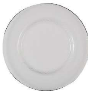
Silver Rim Frosted Glass