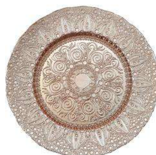
Morocco Blush Glass