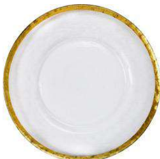
Gold Rim Glass