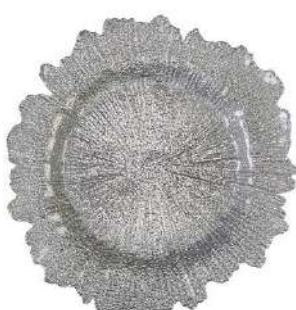
Silver Reef Glass