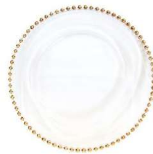
Gold Bead Glass