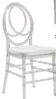
Clear Phoenix Chair