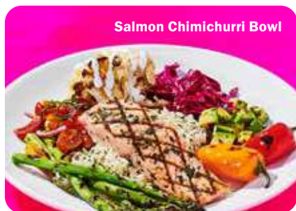
Salmon Chimichurri Bowl

Add Garlic Herb Roasted Potatoes VE GF $2.00