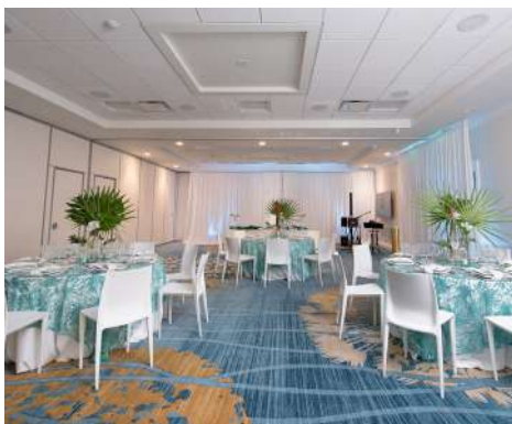
HALF BANQUET ROOM